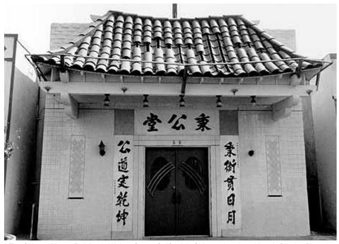
The Chinese Mason Building in Walnut Grove, California's Chinese-American Historic District. A lesson plan for the Locke and Walnut Grove communities is available online: <a href="https://www.nps.gov/nr/twhp/wwwlps/lessons/locke/locke.htm">www.nps.gov/nr/twhp/wwwlps/lessons/locke/locke.htm</a>

With these tools at your disposal, learn about your neighborhood and its history. Understand its past in the context of our national story. Make meaningful connections with your community and help preserve the heritage of all Americans.