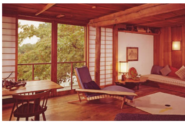
Inside the George Nakashima Woodworker Complex in Pennsylvania, now a National Historic Landmark.

The_National Register of Historic Places (<a href="www.nps.gov/nr">www.nps.gov/nr</a>) is the nation's official list of historic places considered worthy of preservation. Designations can be provided by State Historic Preservation Offices (<a href="www.ncshpo.org">www.ncshpo.org</a>), Tribal Historic Preservation Offices (<a href="www.nathpo.org">www.nathpo.org</a>), and local historic preservation organizations. Sites of exceptional national significance can be nominated for designation as a National Historic Landmark (<a href="www.nps.gov/nhl">www.nps.gov/nhl</a>), but a site is much more likely to gain protection through a local preservation organization.