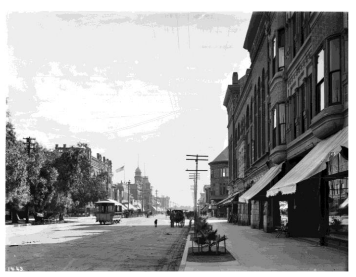
The Certified Local Government Program and the National Main Street Center help preserve character of historic communities, like the Main Street in Riverside, California

(www.historypin.org/project/51-east-at-main-street). Local historical and community organizations could help by including your site in walking tours or literature about your area. If you are an educator in your community, consider incorporating local history and heritage into your lesson plans. The National Park Service's Teaching with Historic Places (www.nps.gov/nr/twhp/index.htm) provides tools and guides for educators. Effective interpretation