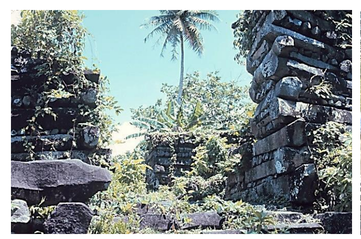
Nan Madol on Pohnpei Island, Micronesia, now a National Historic Landmark.

Historic Asian American and Pacific Islander places exist throughout the United States. Some of these sites, like Angel Island in California or 'Iolani Palace in Hawai'i, are dramatic and well-known. Many more, like the Harada House, can go unnoticed. Fortunately, there are programs and organizations designed to preserve these sites and ensure that their contributions to American history are recognized. Through a variety of federal, state, local, and private entities, citizens and communities across the country are leading successful initiatives to document their history through