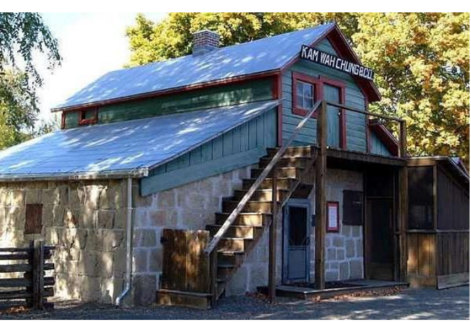
Kam Wah Chung Store in Oregon, now protected by Oregon State Parks.