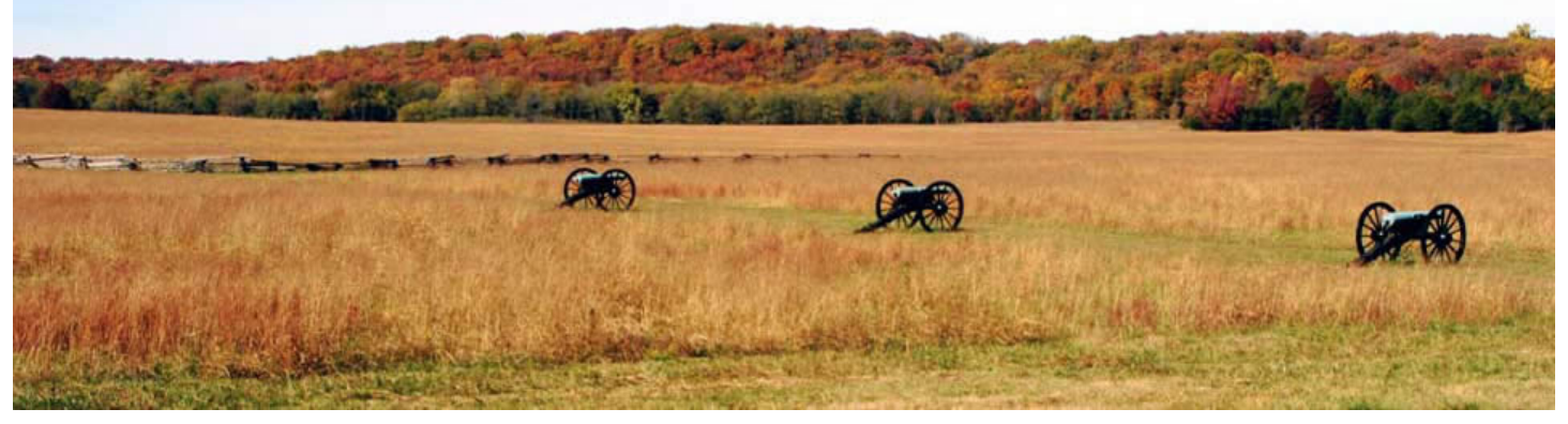
Pea Ridge National Military Park