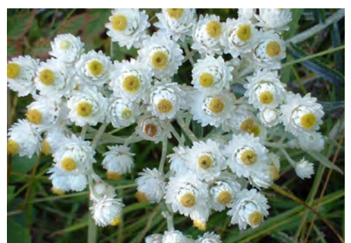
Pearly Everlasting ( Anaphalis margaritacea )

Notes: Pepperweed flourishes in disturbed areas. Flowers have no noticeable scent. Also known as Miner's Pepperwort.