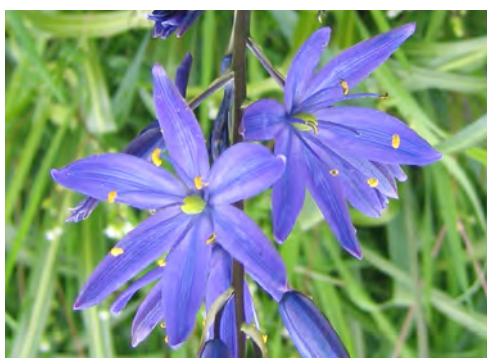
Large or Great Camas (Camassia leichtlinii) Blooms: April - May Habitat: Meadows, prairies and hillsides where moist, at least in early spring. Notes: The bulbs were highly prized by Northwest Indians for their creamy potato or baked pear taste. Blooms much later than Common Camas.