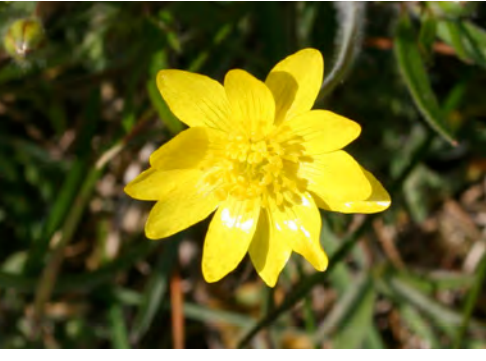
California Buttercup (Ranunculus californicus) Blooms: April - June Habitat: Grassy slopes. Notes: California deviates from the typical buttercup pattern of five petals by having from eight to sixteen petals on each flower.