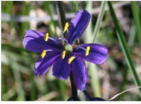
Common Camas (Camassia quemashii) Blooms: April - June Habitat: Open, moist areas, often where dry by late spring, at low to mid-elevations in the mountains. Notes: Not always first to bloom, locals view its arrival as the first sign of spring. Cultivated as an important food source by Native Americans.

For more information, visit our website at www.nps.gov/sajh , or write: Superintendent, San Juan Island NHP, PO Box 429, Friday Harbor, WA 98250