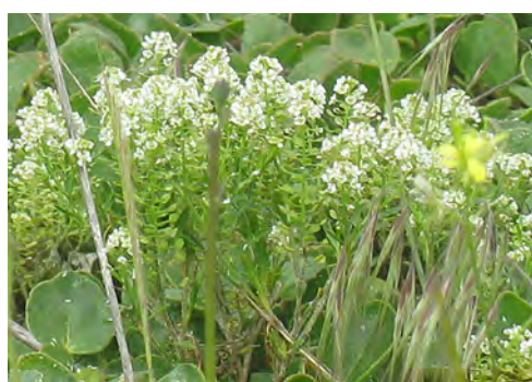
Common Pepperweed ( Lepidium densiflorum )

Notes: There are over 200 species of Indian Paintbrush in western North America. At San Juan Island NHP, the Paintbrush is found only at English Camp.