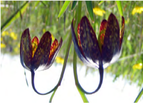
Checker or Chocolate Lily (Fritillaria affinis) Blooms: April - June Habitat: Prairies and grassy bluffs to woodlands and coniferous forests, sea level to fairly high elevations in the mountains. Notes: Coastal Native Americans valued the large, succulent bulbs which when cooked, taste like bitter rice.