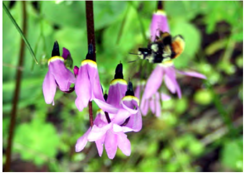
Henderson's Shooting Star (Dodecatheon hendersonii) Blooms: March - June Habitat: Woodlands and prairies, at lower elevations on San Juan Island. Notes: With bold, pink flowers, it may very well be the most striking of the prairie wildflowers. Also known as Broad-leaved Shooting star. Common on Young Hill.