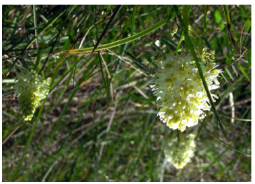
Death Camas (Zigadenus venenosus var. venenosus) Blooms: May - July Habitat: Coastal bluffs and prairies, and moister areas of shrub-steppe and mountain meadows. Notes: Beware. The black-coated bulbs may resemble (but not smell like) onions, but as with the foliage, they are poisonous.