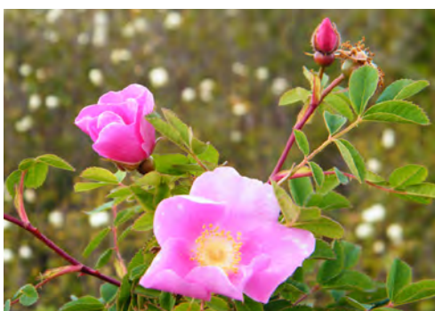
Nootka Rose ( Rosa nutkana var. nutkana )

Notes: Listed as threatened, the park is participating in a recovery plan at American Camp using plants propagated from San Juan Island populations.