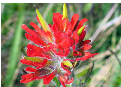
Harsh (Indian) Paintbrush ( Castilleja hispida )

Notes: The rinds of the hips (buds) are edible, but bitter. The seeds are irritating when taken whole.