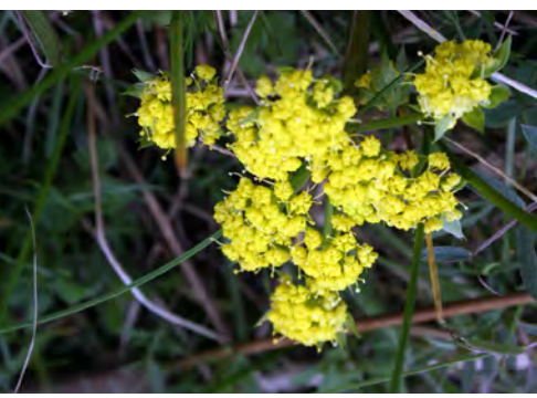
Spring Gold (Lomatium utriculatum) Blooms: April - May Habitat: Low elevations; somewhat moist, open, often rocky areas. Notes: Yellow blooms carpet meadows and rocky outcrops in early spring. The dark green leaves are soft and feathery, much like a carrot. Also known as Fine-leaved Desert Parsley.