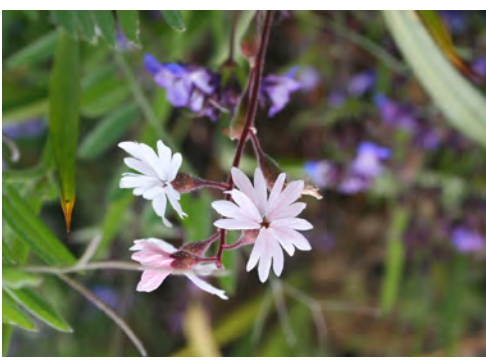
Small-flower Woodland Star (Lithophragma parviflorum) Blooms: March - June Habitat: Prairies and forest openings, sea level to mid-elevations in the mountains. Notes: These star-like flowers are quite distinctive with their unevenly shaped petals. The stem bears up to 14 flowers. The five petals are bright white.