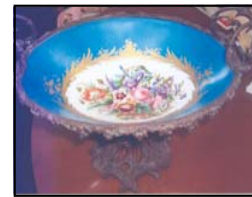
Turquoise bowl in drawing room.