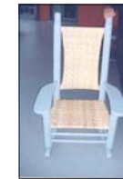
Newly caned porch rocker.