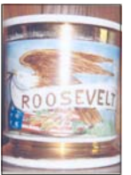
TR's shaving mug in splash closet.