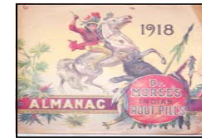
1918 Almanac in cook's room.