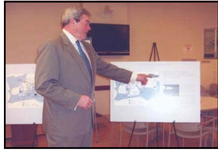
Showing the alternatives