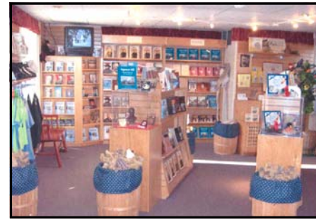
Bookstore ready for customers