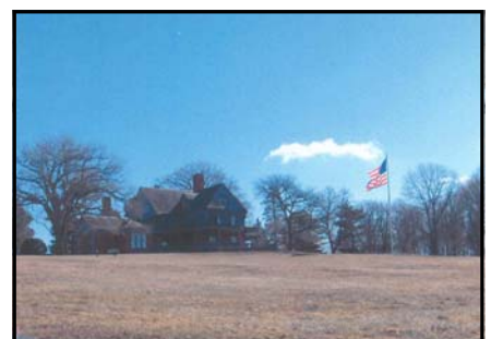
Smoke appears to rise from the flag