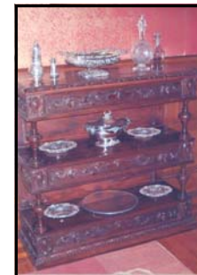
Sideboard in the Dining Room