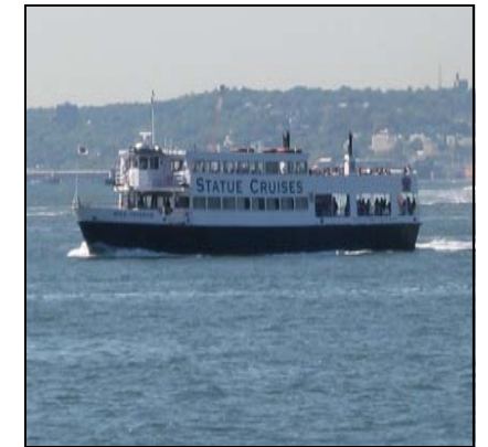
Water Traffic in Upper New York Bay visible on the volunteer trip