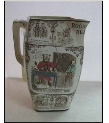
"Roosevelt Bears" souvenir pitcher.