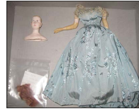
Doll wearing miniature of Edith's inaugural ball gown.