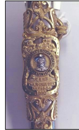
Rough Rider reunion 1900 souvenir sword.