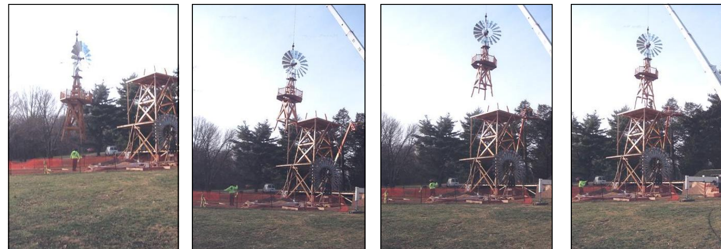
Replacement windmill sail section (fan blade section) is raised into position.