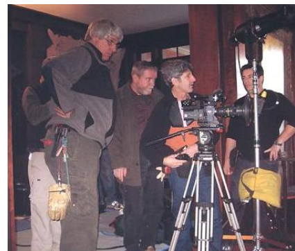
Left to Right, the lighting director, producer/editor, and cinematographers set up a shot.

From June 23 to 25, 2009 three members of the Ken Burns 's film company, Florentine Films , visited Sagamore Hill in the first of many trips to examine the photo archives and tour the TRH. Ken Burns is now producing an ambitious six-part, 12 hour documentary about the life and times of Theodore, Franklin and Eleanor Roosevelt . The program will air on PBS TV in 2013.