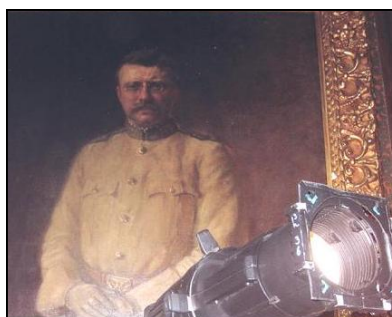
"I never had the room this bright."