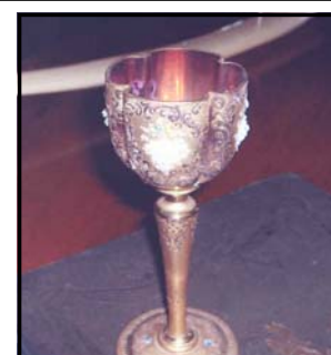
Chalice in the North Room