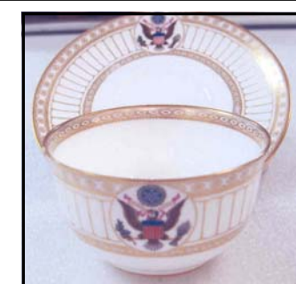
Cup and saucer with Presidential Seal