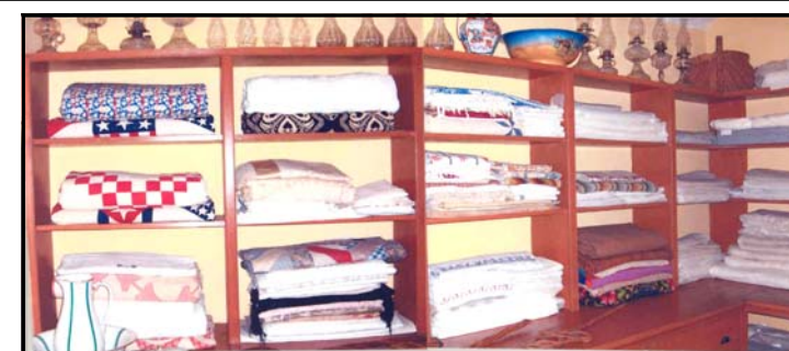
Third floor Linen Closet