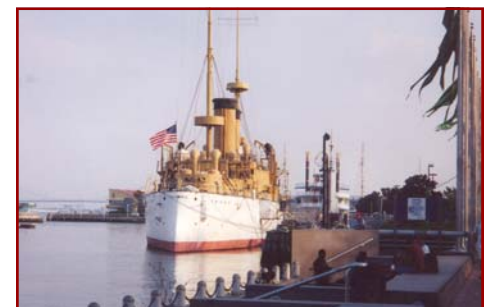
Admiral George Dewey's flagship the Olympia moored in Philadelphia

There was a recent ad in the Sunday, New York Times geared to the owners of dogs. A retail company was looking for a dog to become its mascot. The ad included a "Dog Lovers Guide to Manhattan. Of the fourteen pet friendly parks, one park caught my eye. The park was Theodore Roosevelt Park at Central Park West at West 81 st Street. This writer's family lived at Broadway and 90 th Street for forty years and no one ever heard of the park. Was it named after TR's father? The Museum of Natural History is very near the park or was the name chosen to honor TR? Does anyone know after whom the park is named?