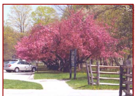
Blooming cherry trees in the parking lot