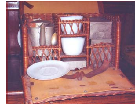
Picnic basket with utensils kept on top of icebox in the pantry