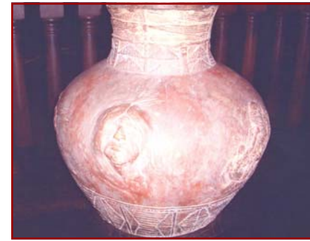
Vase with western motif, by Edward Kemeys, in the North Room