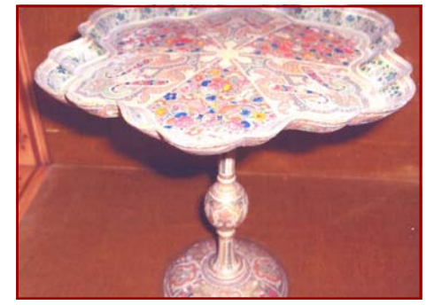
Calling-card tray and stand on top of the Herter Brothers cabinet, in the Drawing Room