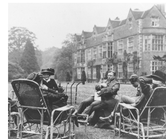
TR and family in front of Chequers Court