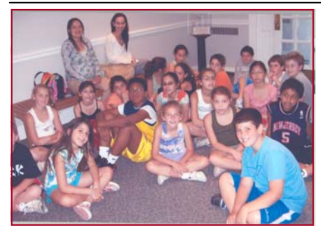
Students from East Hills

For some of the participants, this was their first class, for others, it was a refresher course. New things learned included the fact that the Red Cross is once again recommending the use of slapping of the upper back when a person is choking and the need to remove all upper body clothing on the victim when administering the Automatic External Defibrillator shock. The reasoning behind removing the victim's shirts is to prevent igniting the shirt when using shock to help start the victim's heart. However, the site is currently precluded from using the device until arrangements are made for a medical doctor to certify the results. Noreen Hancock hopes to have a doctor on board shortly.