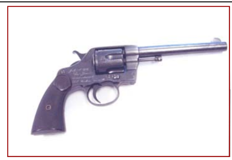
.38 Colt Revolver carried by TR at San Juan Hill