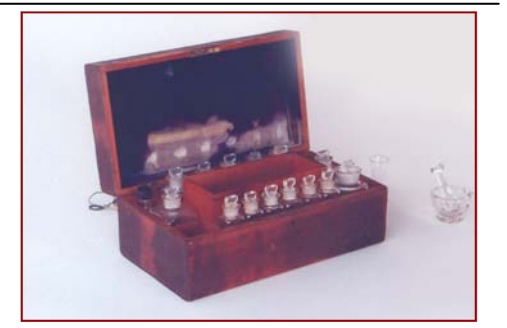
TR's African Safari Medicine Kit