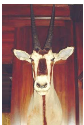
The Oryx in the Foyer

Editor's note: TR was referring to the March 1917 revolution led by Aleksandr Kerensky, that overthrew the Czar, not the revolution of November 1917, led by Lenin, that ousted the Kerensky government.