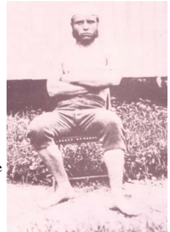
TR in his rowing outfit

Will-power manliness can also appear to have an air of desperation, or can be said to be desperate underneath, despite an air of confidence on the surface. Some would interpret T.R.'s manliness as too emphatic to be true, because true manliness has more quiet in its confidence, less stridency in its assertiveness. Yet if all we know is based on social construction, meaning that all we know is contingently based on how society is now- and so manliness is impermanent and will pass away in our gender-neutral society- then it is reasonable to feel anxiety instead of confidence."