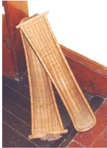
Jai Alai cestas (baskets)