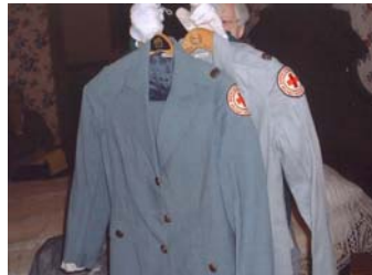
Eleanor Butler Roosevelt's, Mrs. TR Junior, WWII Red Cross uniforms

The Curatorial volunteers and staff also completed re-housing a collection of over 40 assorted textiles stored in the TRH. The artifacts included items such as a woolen, dark blue dress military jacket from the Spanish-American War; numerous women's dresses; and several woolen World War I uniforms once owned by T. R.'s sons. The artifacts had been stored for years on padded clothes hangers, an acceptable practice in the museum field at the time. However, current standards recommended that textiles are best preserved in flat storage rather than hanging storage.