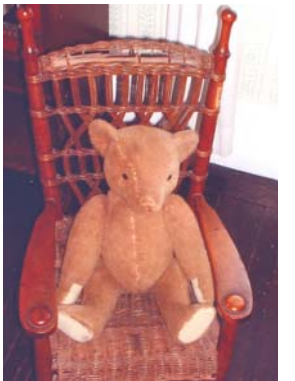
Teddy bear in south bedroom