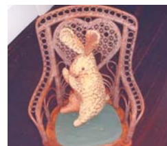
Other toys that are also in the south bedroom.