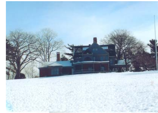
Snow closes site on President's Day