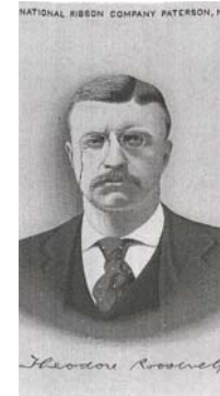
TR on silk hanging