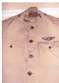
Quentin Roosevelt's WWI Uniform

Curatorial volunteers were re-housing a few family uniforms. The first uniform, a WWI U.S. Army jacket (blouse) had embroidered pilot's wings. Also note the Signal Corp flags on the collar. The jacket belonged to Quentin Roosevelt. The next uniform had a name tape with Quentin Roosevelt in the collar.