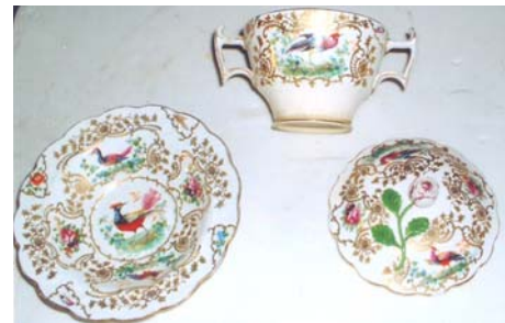
Canisters and china from the pantry.