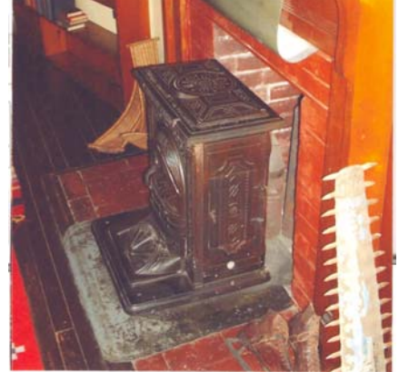
The Franklin Stove in the fireplace