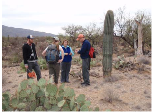
The groups get ready to measure saguaros.