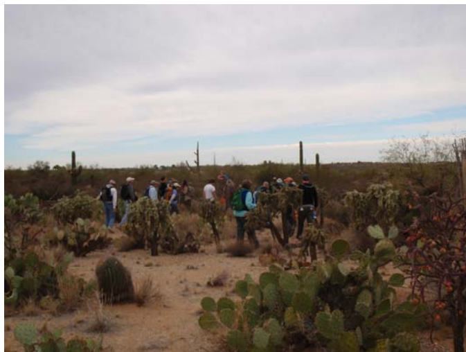
Heading back at the end of the day