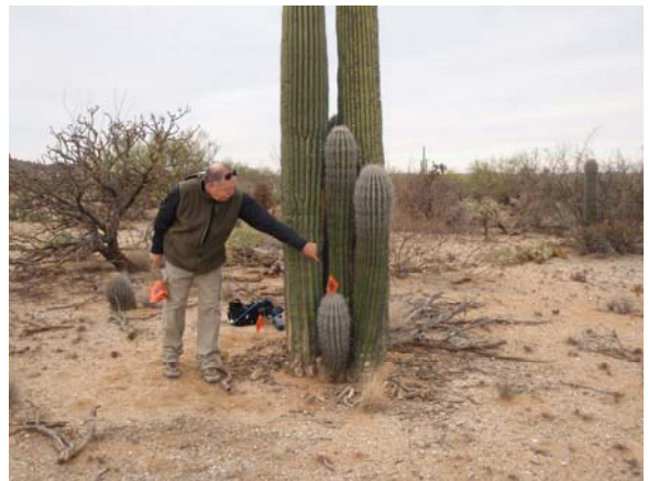
Flagging after measuring