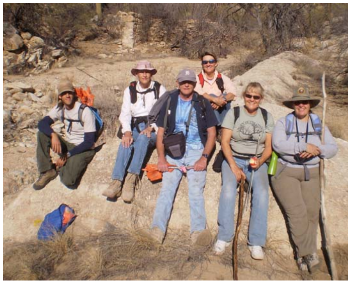
Group photo for January 11, 2010.