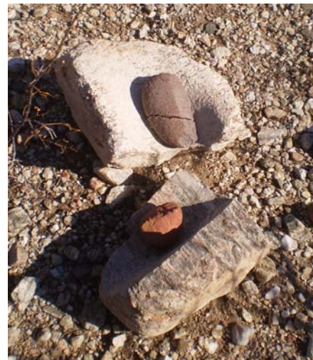
On this plot archeological artifacts were found. The image on the left is a photograph of grinding holes found on a slab of rock. The image on the right is a photograph of two metates and manos – these are stone tools used to grind food.