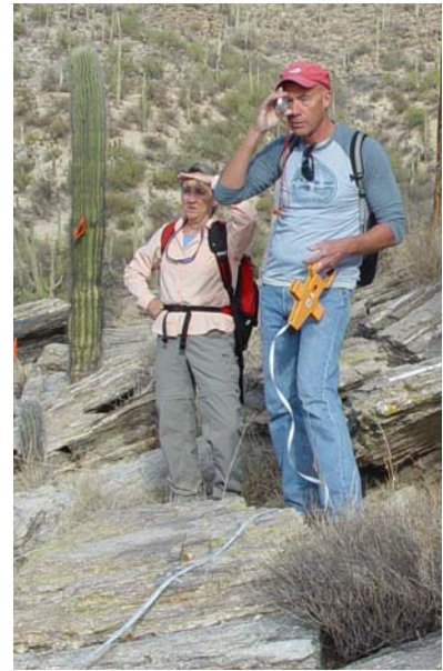
Counting and measuring Saguaros of different sizes.