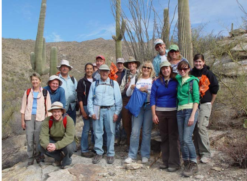
Saguaro Plot #18