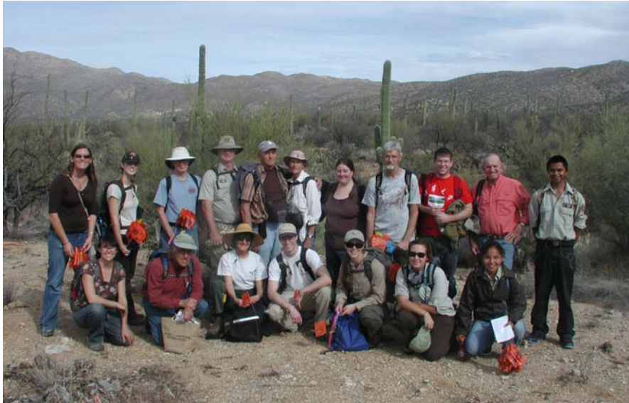
Saguaro Plot #11