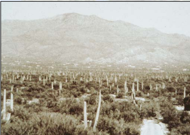
Saguaro forest at Saguaro National Park (East) 1998