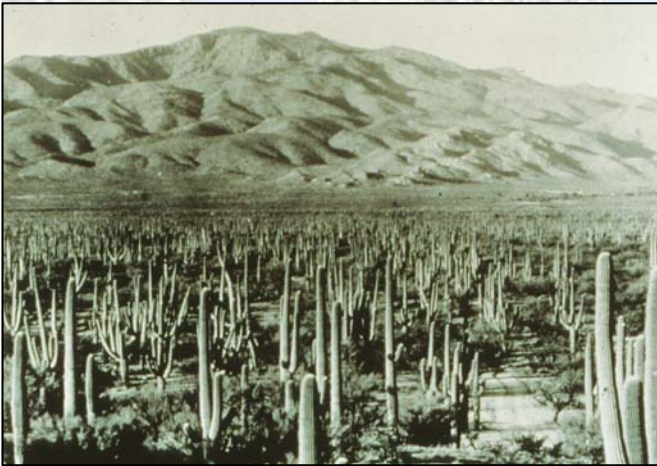
Saguaro forest at Saguaro National Park (East) 1935

Every ten years (coinciding with the U.S. population census) Saguaro National Park conducts its Saguaro Census, where the giant cacti are counted and measured. Although the Saguaro Census started in 1990, some areas are included that were first surveyed as far back as 1941. This long-term monitoring data is used to assess the health of the park's saguaro population. It provides information for visitors and helps the park preserve this giant cactus.