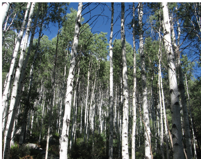
The Spud Rock Campground aspen stand is an example of a healthy, mature, even-aged stand. This area burned in the 1994 Rincon Fire.