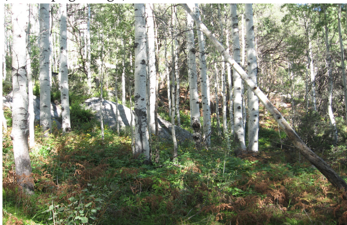
The aspen canopy provides cover for a dense herbaceous understory. Many animals utilize the increased forage and cover of the understory.

All aspen stands are located within the Saguaro Wilderness Area. Visitors that wish to hike to aspen stands do not need a permit, but a backcountry camping permit is required for overnight stay. Applications for a backcountry camping permit are available online ( www.nps.gov/sagu ) or at the Visitor Center.