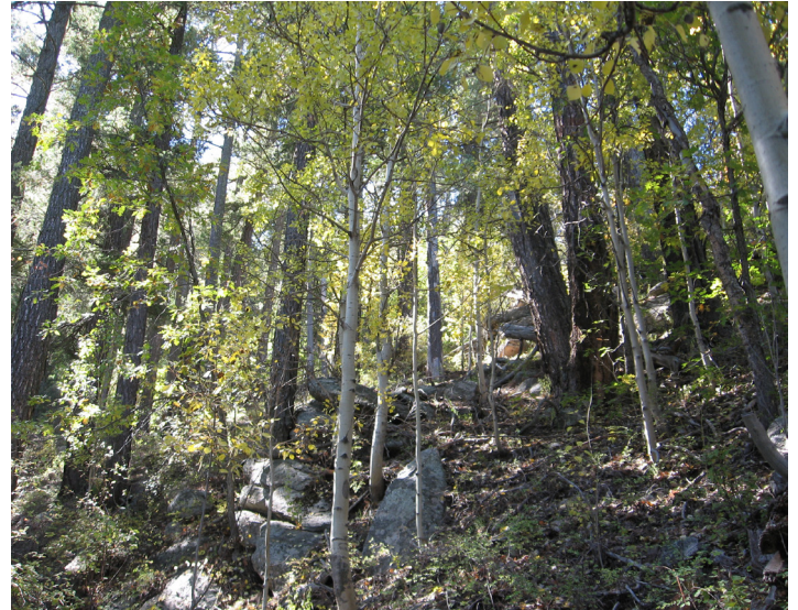
An aspen stand along the Rincon Peak trail. Visitors can find aspen along several trails and campgrounds in the Saguaro Wilderness Area.

Aspen requires full sunshine to flourish. Shade significantly weakens tree vigor and prevents regeneration. A healthy aspen stand provides as much forage as a grassland and 10 times more palatable biomass than conifer forests. Deer and other browsers eat young aspen saplings year-round for the protein-rich leaves, buds, and sprouts. Aspen provide important feeding and nesting habitat for numerous songbird species. In the Southwest, mature aspen canopies provide shade necessary for forbs and berry-producing shrubs, which are important components in the diet of black bears. The understory vegetation and the mixture of woody and herbaceous root systems also protect watershed quality by controlling flooding and erosion.