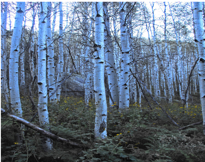
Aspen stand near Spud Rock Campground. Many of the individual trees in this photo are clones connected by a common root system.

Threats to aspen in the western US include drought, warming temperatures, chronic heavy browsing, and fire suppression. These factors cause mortality in older trees or inhibit reproduction.