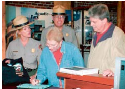
Center, row, from above: New park Visitor Center and Argonaut Hotel opens to the public in the former Haslett Warehouse, 2003. Crew and volunteers celebrate scow schooner Alma ’s 100th birthday with a ship-shaped cake, 1991. The television show “Nash Bridges” begins filming episodes on steam ferry Eureka , 1996.