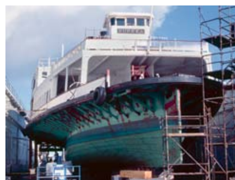
Steam ferry Eureka in drydock for major restoration work, 1998.

But for all that, the first 25 years have only been a shakedown cruise. The real trip will begin with C.A. Thayer ’s sails catching the wind, next-generation exhibits filling the Maritime Museum, and visitors accessing park stories and resources at the touch of a screen. We’re casting off for the future and you’re just in time—welcome aboard!