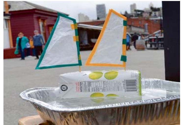
Here is Coconut Dream , a two-masted schooner with a pair of four-cornered sails. Materials: medium juice box, two skewers, part of an old apron, electrical tape for decoration, and inside the boat is a small scoop of sand to keep it stable in the water. Check out sailing ship rigs here, museum.gov.ns.ca/mma/AtoZ/rigs.html