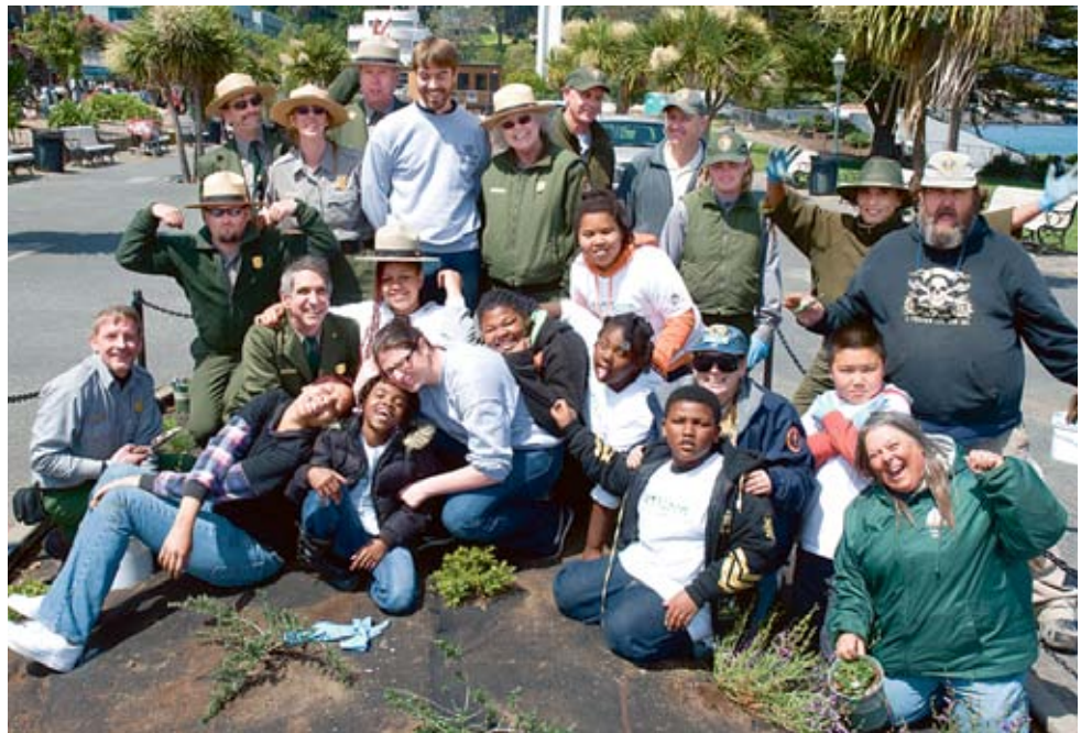
Top, left, Poster advertising the annual sea music concert series now in its 25th year. Above, Park employees and kids from the Boys and Girls Club of SF, create a native plant garden at Aquatic Park, 2010.