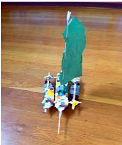
This is another example of a catamaran that was built by Arlo Rucker, the son of Captain Jason Rucker of the Alma . Materials: skewers, duct tape with a splatter pattern, scotch tape, different colors of tissue paper and construction paper.