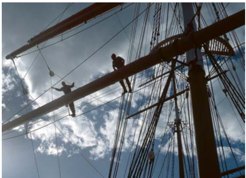
The aloft program on Balclutha debuts, 1992. Park Rangers climb aloft in Balclutha ’s rigging and demonstrate how to haul in the square sails and lash them to the yards. Check our website www.nps.gov/safr/25anniversary.htm for more information on events and programs happening throughout our 25th year.