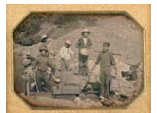
Left, Balclutha moves to Hyde Street Pier, 1988. Above, the California Gold Rush Sesquicentennial is celebrated at the pier, 1999. Daguerreotype image circa 1850, with six miners.

Some of the accolades the park has taken onboard include: accreditation by the American Alliance of Museums, the California State Governor’s Historic Preservation Award, the CA Heritage Council award, and a National Association for Interpretation Media award.