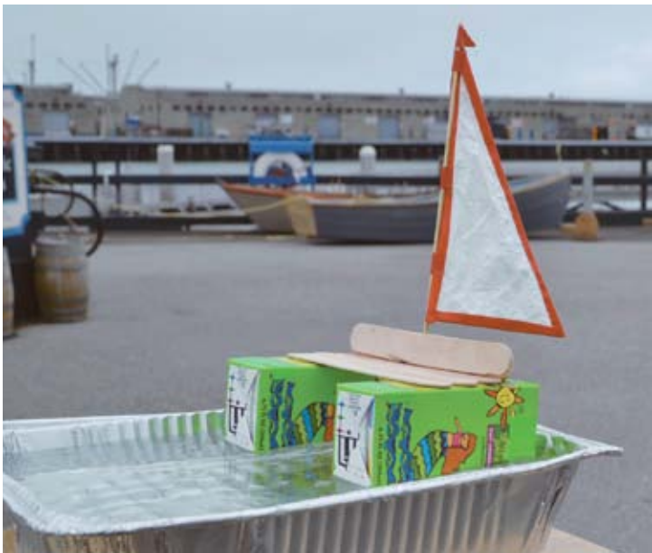
This is my juice box catamaran (a type of boat with two hulls instead of one), called The White Grape . Materials: two small juice boxes, popsicle sticks, craft glue, part of an old apron, skewer, electrical tape for decoration.

These are the boats we made at the park!