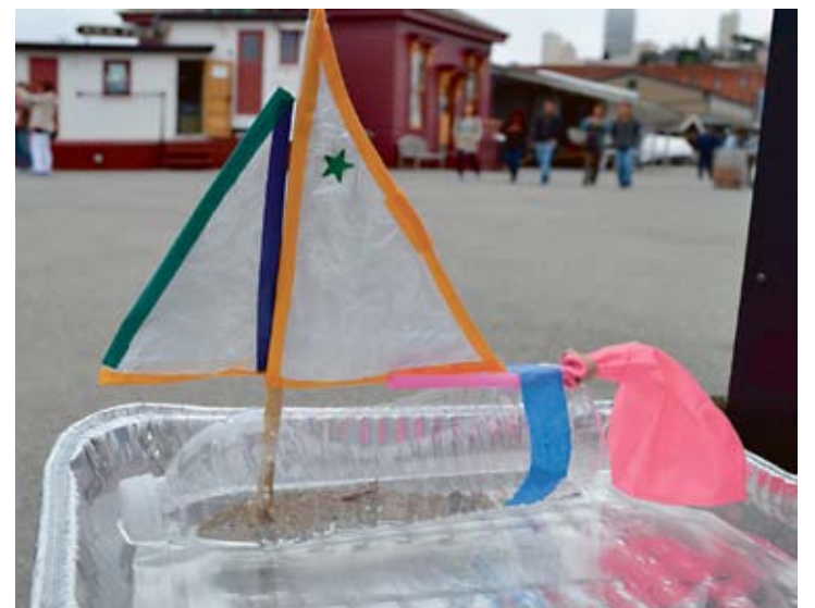
The Maggie , a sloop with mainsail and jib and optional outboard engine. Material: plastic water bottle, chopstick, drinking straw, balloon, old apron, sand for ballast. (The boat builder is also designing a square-sail rig that might work better with the outboard.)

Now it's your turn! Create your own design or use one of our boats as a guide. Send us a picture of your boat and we'll put it on our website! Happy Summer!