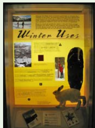
Updated exhibits at Kawuneeche Visitor Center

The remaining 20 percent is distributed across National Park Service areas that do not charge fees to address those same goals.