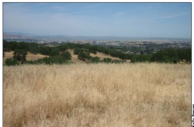
By the time John Muir strolled on Mt. Wanda, non-native grasses had replaced the native grasses. The vegetation shift likely contributes to the accelerated hillside and stream channel erosion seen today.