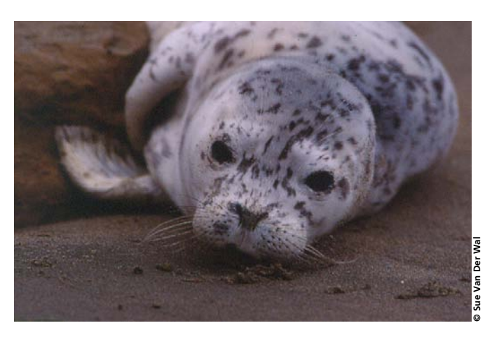
At Point Reyes National Seashore, harbor seal pups are born from March through June. Surveys are done more frequently during these months to monitor how the numbers of seals change weekly and annually.

Harbor seals ( Phoca vitulina ) have been monitored at Point Reyes National Seashore (PORE) and Golden Gate Recreation Area (GOGA) for 30 years, often with the help of dedicated volunteers. Harbor seals are one of 30-plus marine mammals documented at PORE, but they are the only marine mammal to live at PORE year-round. Because harbor seals are top predators in the marine food web and their populations respond to changes in oceanography, they are an excellent indicator of marine ecosystem condition. Twenty percent of the harbor seal population of mainland California resides at PORE, an estimated 7,000 seals.