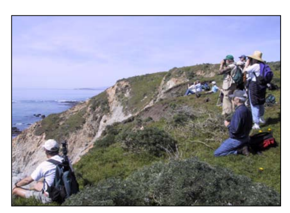
Volunteer biologists stand above the beach to count the number of seals resting below. They view the seals through binoculars to let seals rest without being disturbed.

The Project: Monitor the numbers of seals and their pups within Point Reyes National Seashore and Golden Gate National Recreation Area. Also, record human disturbances.