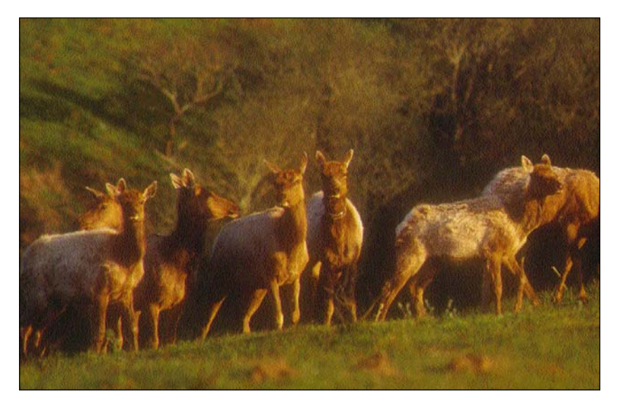
Tule elk (Cervus elaphus nannodes) is a subspecies of elk native to California. In 1978 tule elk were restored to Point Reyes National Seashore after being absent from the area for over 100 years.

The Project: Monitor the survival, natality (ratio of live births in an area to the population of that area), and spatial patterns of tule elk using radio telemetry collars. Examine environmental factors that may be affecting the population dynamics of the elk.