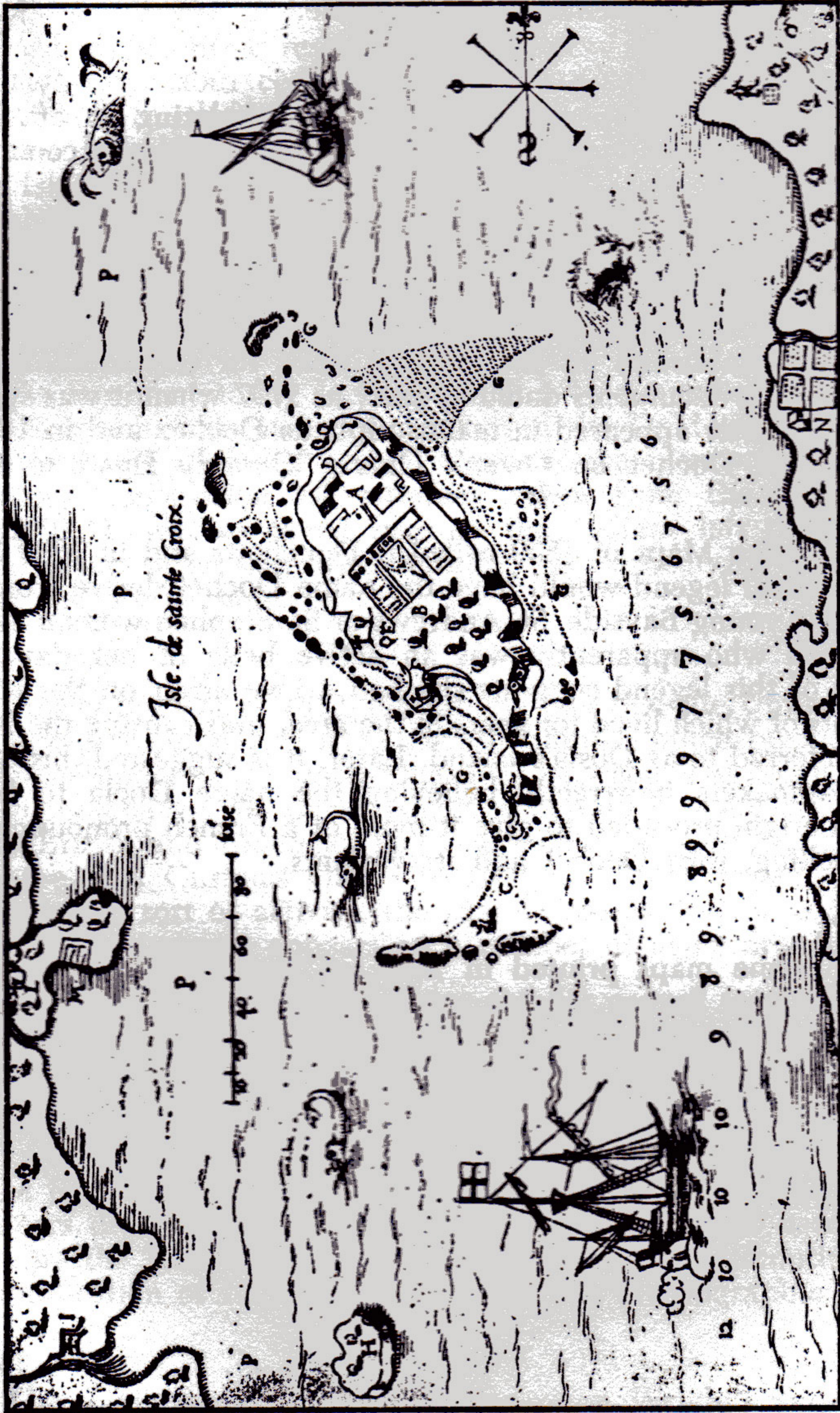
CHAMPLAIN'S MAP OF SAINT CROIX ISLAND