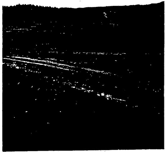
The Ute Pass Trail as seen in the distance, on the flats of the Bayou Salado, crossing in front of the Petrified Forest.