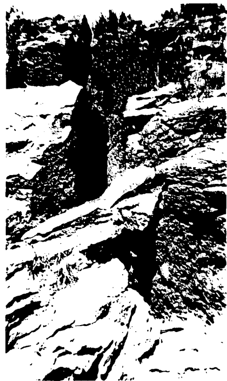
This picture gives a better view the natural fortification.