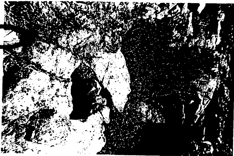
This is the picture of Fortress Mountain giving an idea of what the Utes used as a fortification. The whole was made by hand