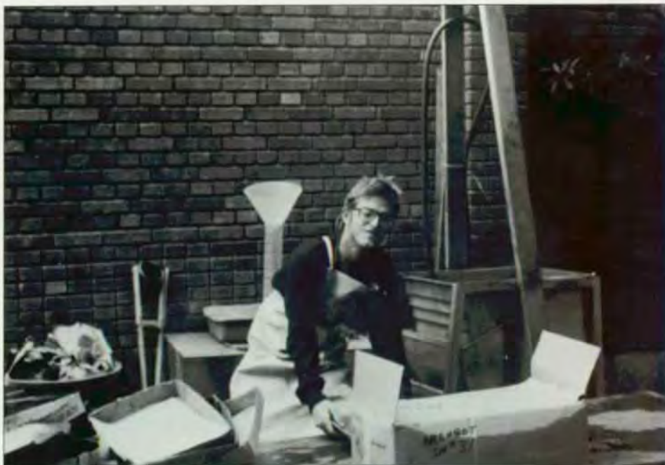
Competent hearing impaired member of Project Origins, who also experiences Cerebral Palsy, utilizes specialized equipment for floatation of archeological matrix sample.

Archeology is not the only matrix within which this model can be applied. The best candidates for implementation of structural mutualism are scientific disciplines with a wide array of tasks. Many of these tasks should require a low entry level of skill to ensure immediate participation for persons with handicaps. Many of the tasks should have a range of complexity that provides an individual increasing options as new skills are mastered. It is this dynamic relationship between a large number of tasks and their increasing complexity that makes it worthwhile for all those participating to invest the time and energy in the reorganization and adaptation necessary for the creation of such a new entity.