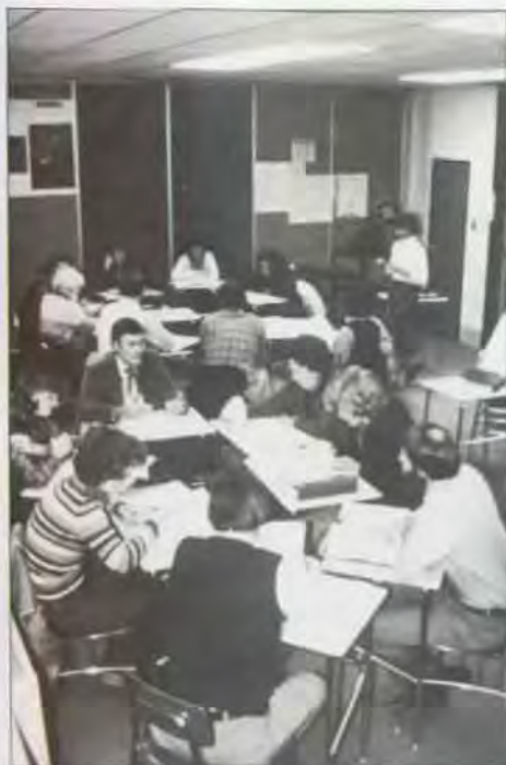
Teacher demonstrates model lesson to her colleagues in an after-school class in anthropology.