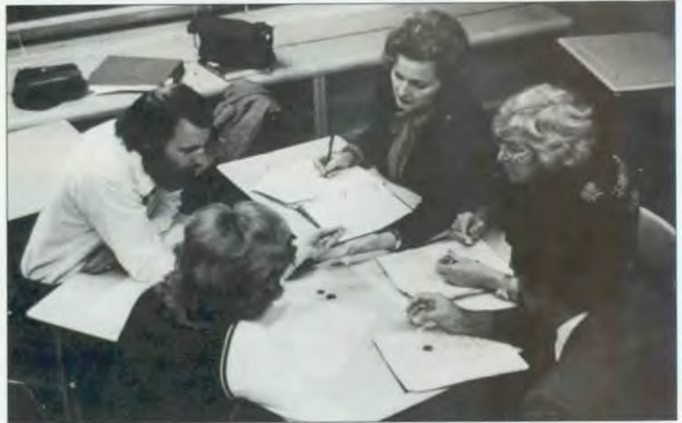
Teachers examining coins in an "archeological experience."

This monthly topic approach was developed to meet the needs of both teachers who had had no anthropology and those who already had studied some anthropology. In addition, it offered teachers an in-depth approach to a few topics they could learn and teach in their own classes, rather than a more traditional, college survey approach. The topics changed each year, but included at various times human evolution, archeology and ecology, civilizations of the past, Native American cultures, anthropological fieldwork, socialization in non-Western societies, and the anthropology of American life.