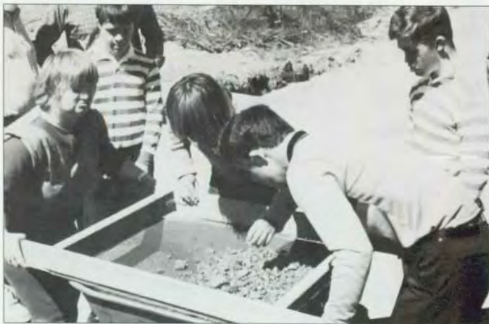
Participants in a Projects Origins field experience screening archeological matrix for pottery, lithic, bone, charcoal, and other materials at the Marana Mound Site (AZ AA 12-252).