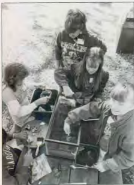
A "box dig" is used to introduce basic steps of excavation and to convey such concepts as stratigraphy and context.

On the last day of the camp session, the youths were taken by boat to a nearby offshore island, where the remains of a late 19th-century fishing vessel were embedded in the surf zone. Unfortunately, during the two weeks between staff reconnaissance of the site and the campers' arrival, the wreck had been covered completely, and efforts to relocate it by probing and digging were fruitless. Switching to Plan B, the youngsters were taken to the remains of a wood-and-iron hull freighter, where they were asked to survey and to assess the debris. Their conclusions were amazingly perceptive. The captain of the charter ship also knew of a ballast pile nearby in 15 feet of turbid water, where even the most skittish snorkelers took one or two plunges downward to view the mysterious remains. The "Dugouts to Doubloons" camp was