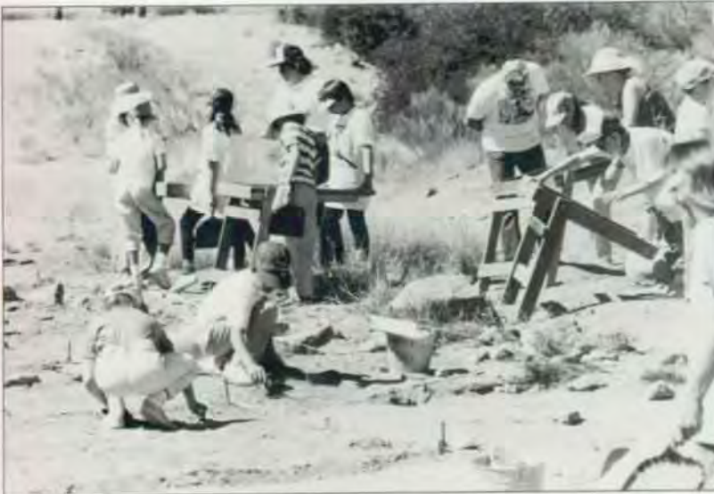
Adult volunteers observe young "archeologists" at work

then close your eyes and imagine. How old is this tool? How did it get here? Who made it? What was it used for? Hold the answers to your questions in your mind, taking with you a very special part of the past, then put the artifact down in its original location. When these suggestions are offered to a class it is possible to actually see youngsters closing their eyes and imagining.