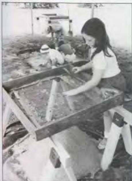
Youths participating in the Museum of Florida History's summer camp excavate a simulated site and learn basic archeological techniques.

a well-received activity that suggested that youths are interested in maritime history and thrilled by underwater archeology.