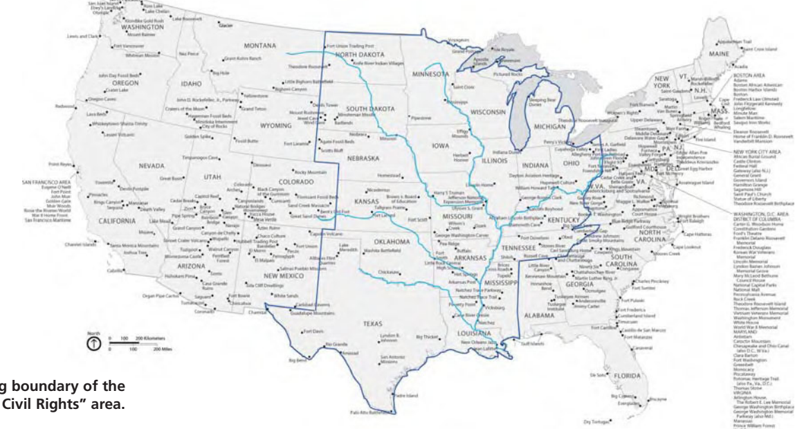
Map showing boundary of the "Civil War to Civil Rights" area.

<sup>1</sup> Ulysses S. Grant III, This Week Magazine, Oct. 16, 1960, quoted in Robert J. Cook, Troubled Commemoration, p. 1. Troubled Commemoration sets forth in detail the actions of the National Commission and the subsequent problems that arose during the centennial celebration. <sup>2</sup> District of Columbia Committee on Organization, "The Civil War Centennial," in Cook, ibid., p. 23.