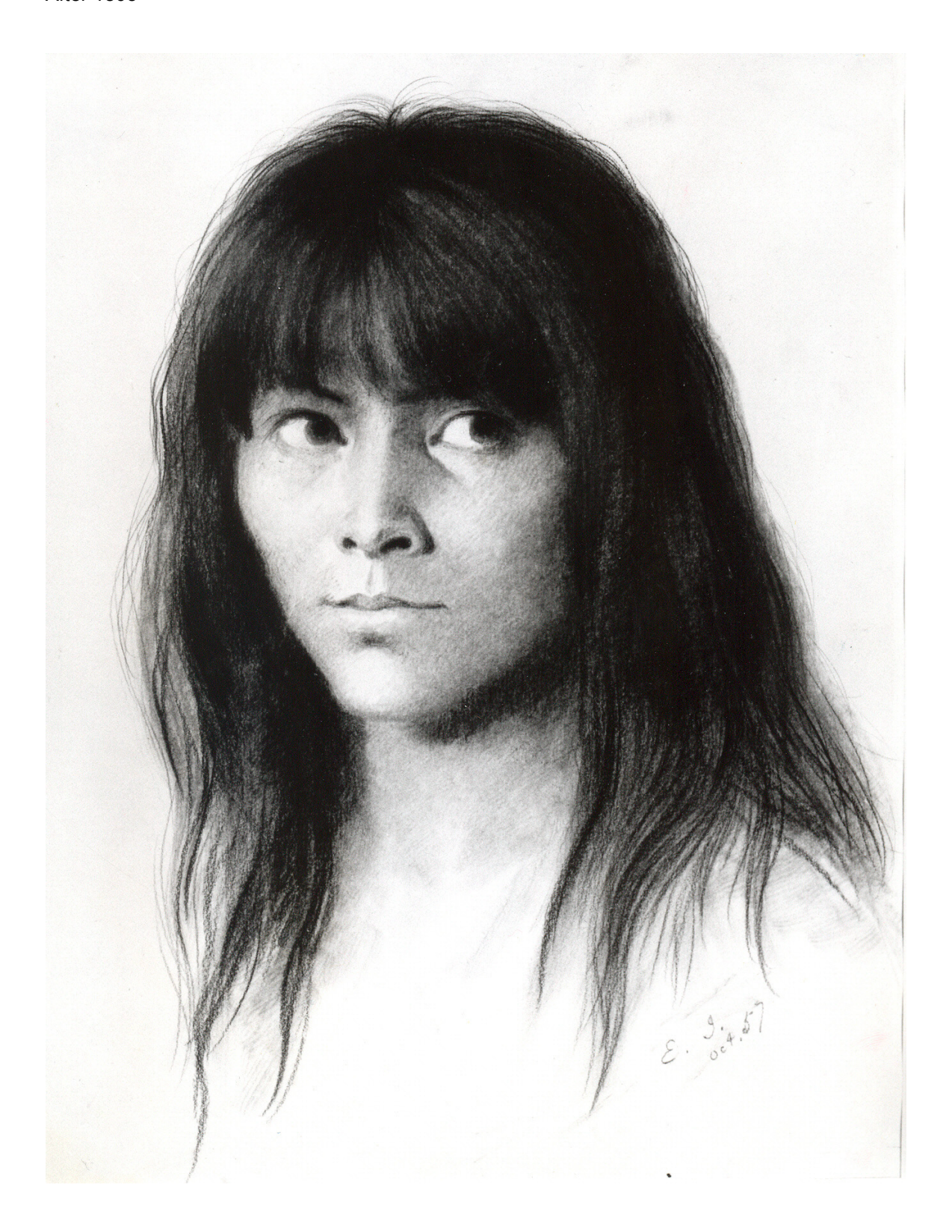
Untitled, painted by Eastman Johnson in October 1857 at Grand Portage. It is charcoal and crayon on paper and printed with permission from the St. Louis County Historical Society, Duluth, Minnesota.