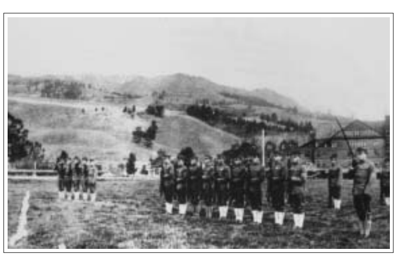
Guard mount at Fort Yellowstone in Mammoth Hot Springs, ca. 1910.

AH : That's right. I made the mistake in the first edition of The Yellowstone Story of telling it like the original park tale. The