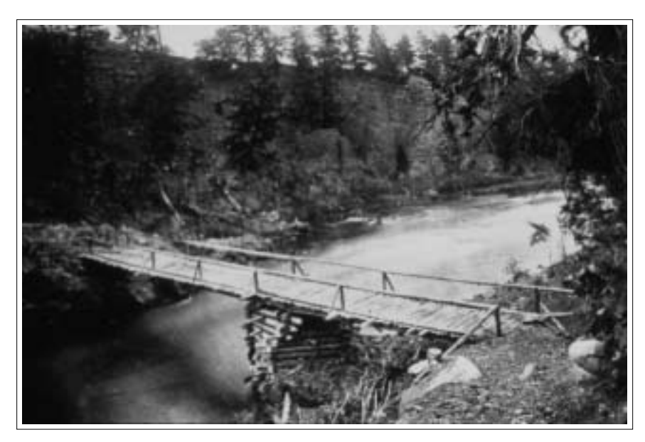
Baronett Bridge across the Yellowstone River.

historian. I was transferred from engineering to the naturalists' department in December 1960, as the park's first historian.