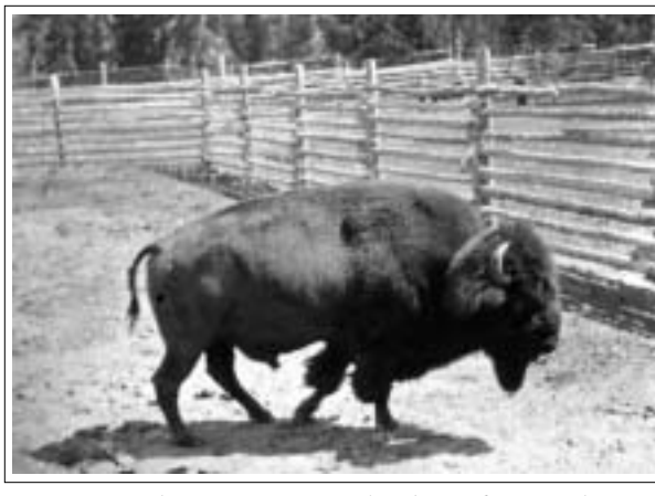
Bison in show pen on Dot Island, 1906.