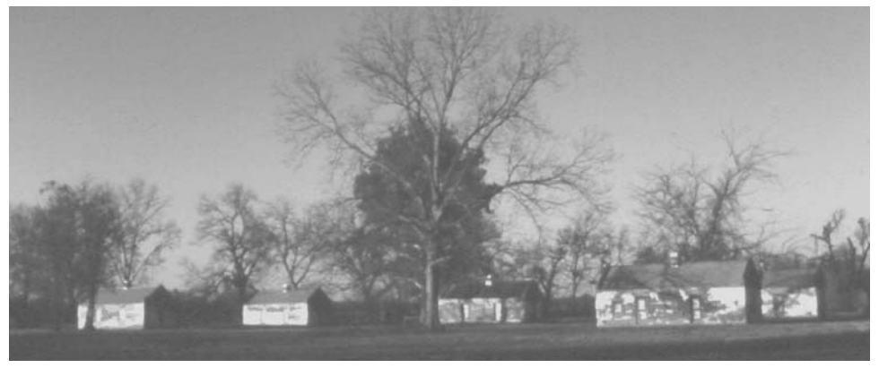
Figure 6. Brick slave quarters, later used as housing for tenant farmers, Magnolia Plantation. National Park Service photo.

out into the sunshine. And I have found that we have to explain these complexities to Park Service professionals from a variety of disciplines, to travel writers for newspapers and magazines, to visitors who come to the park and the heritage area, and to ourselves on the park staff. The process is an iterative one of constant refinement as the results of new research come to light.