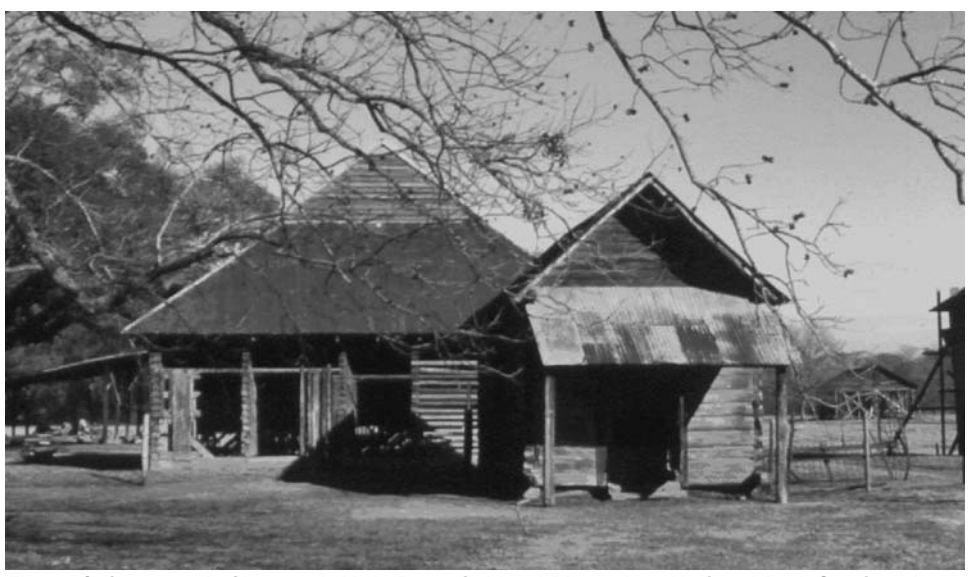
Figure 4. Carpenter's Shop and Mule Barn, Oakland Plantation.

A National Heritage Area is a place designated by the United States Congress where natural, cultural, historic and recreational resources combine to form a cohesive, nationally distinctive landscape arising from patterns of human activity shaped by geography. These patterns make National Heritage Areas representative of the national experience through the physical features that remain and the traditions that have evolved in the areas. Continued use of the National Heritage Areas by people whose traditions helped to shape the landscapes enhances their significance.