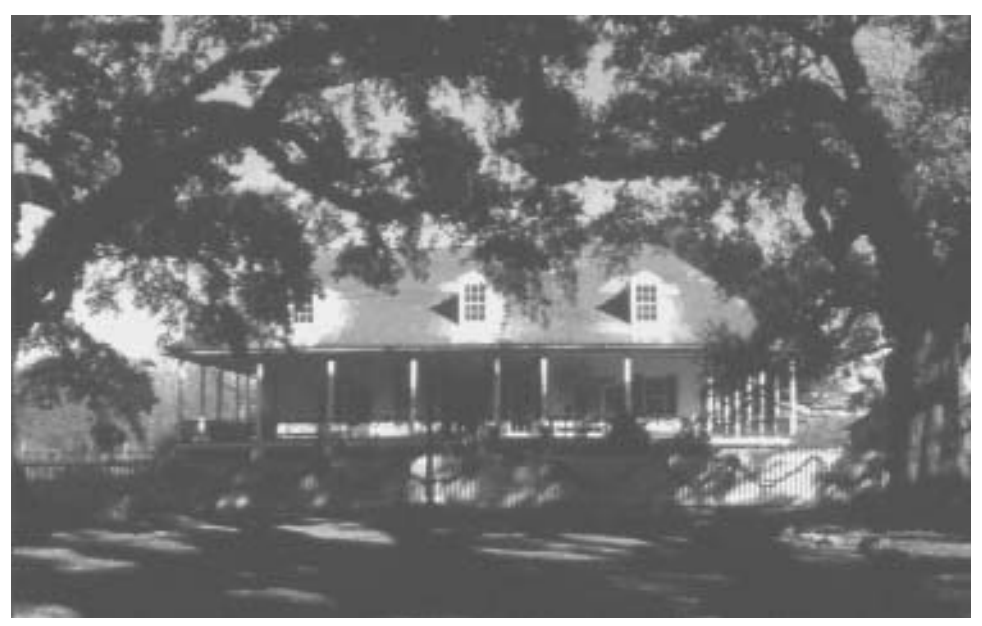
Figure 5. Big House, Oakland Plantation.

interpretive programs would not discuss this issue. In an area just up the road and across the river, it is our responsibility to discuss the Colfax massacre that changed the way civil rights were administered in the United States.