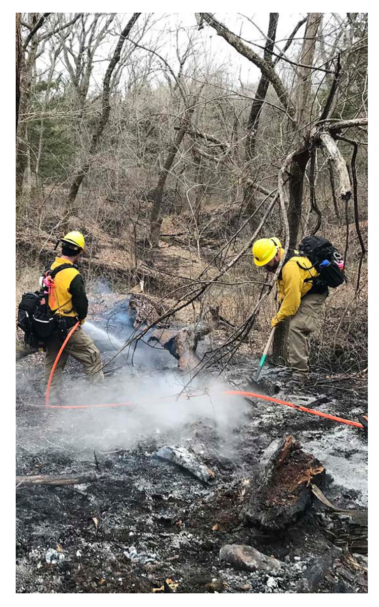
Firefighters working the Veterans Lake Fire

Hazard trees and smoldering materials were cleared from the Veterans Lake Trail, which reopened on Friday, March 25th. The Rock Creek Multi-use Trail System reopened the following week.