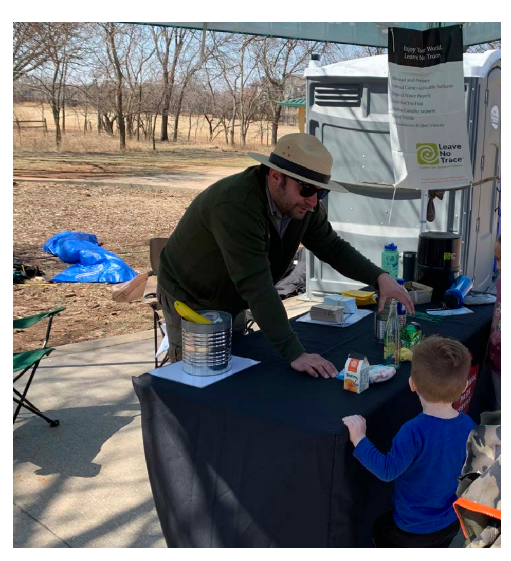
A park ranger showing visitors the trash timeline

It's a dangerous business stepping out your front door. To many the natural world is a scary place, but with proper planning and education that anxiety can be lessened. To help introduce and remind visitors of the Leave No Trace ethic, the National Park Service teamed up with Martin Park Nature Center to host 4 days of Leave No Trace activities in the park's Story Circle. One of the activities was the trash timeline, where visitors could guess how long it takes for common trash items to decompose. Many are shocked when they learn it can take a million years for a glass bottle to fully break down. Another activity was Camp Oh, No!, a sloppy campsite where people could identify what was wrong, and learn how to correct those mistakes to ensure their future campsites are clean and tidy.