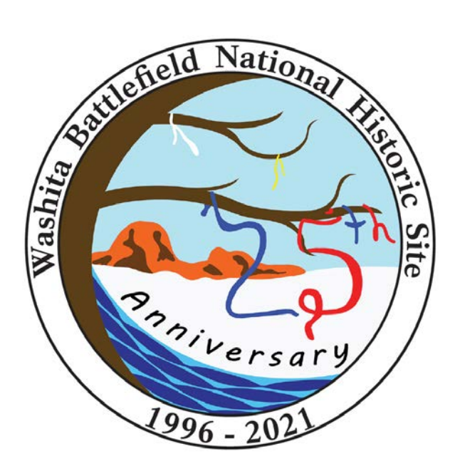
Washita Battlefield 25th Anniversary Logo

Anniversary Logo Patch during the year. There is even a 25th Anniversary Challenge Coin booklet that anyone can do to earn the coin. In March the Visitor Center opened the "Remembering the Past, Working Towards the Future" Student Art Exhibition. This exhibit displays art from kindergarten to high school from all across America. Throughout Spring the park will be showcasing a parade float built to represent the park's 25th anniversary theme.