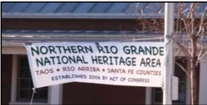
A banner welcomes community members to a NRGNHA, Inc workshop held in Tierra Amarilla on March 17 th .

In March, Northern Rio Grande National Heritage Area, Inc sponsored six public workshops in Santa Fe, Taos and Rio Arriba Counties. The goal of the meetings was to gather input from residents on their vision for local communities and for the region as a whole. The workshops are part of a broader outreach strategy in support of the Heritage Area's comprehensive planning process.