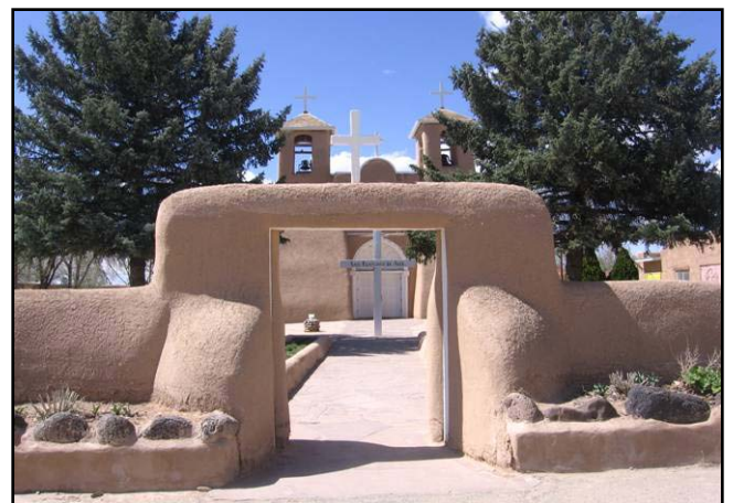
San Francisco de Asis, in Ranchos de Taos

Check our website, www.nps.gov/norg/ for more information.