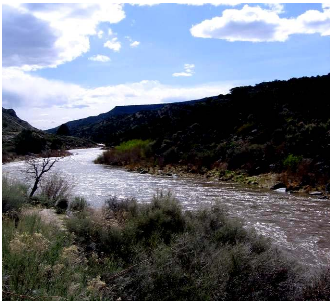
The Rio Grande nourishes communities of all sizes in the region

Northern Rio Grande National Heritage Area now has a vibrant presence on the world wide web – www.nps.gov/norg/ . Visit the site to learn general information about the region as well as more specifics on upcoming meetings and the management planning process. Also, if you are interested in offering ideas for future projects, please fill out our questionnaires at http://www.nps.gov/norg/how-can-i-help.htm .