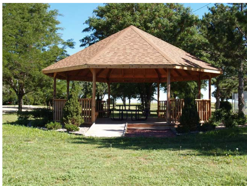
Nicodemus Township Board's Gazebo

We have also built a gazebo between the tennis court and the playground. We are extremely pleased with how this structure turned out. McWilliams Construction from Hill City built the gazebo and installed the landscaping. We are waiting for the electrician to install lighting and power and eventually, we will have a water faucet installed near the gazebo. There is also an outdoor grill nearby. The gazebo has already been used on several occasions and is a welcome addition being enjoyed by all.