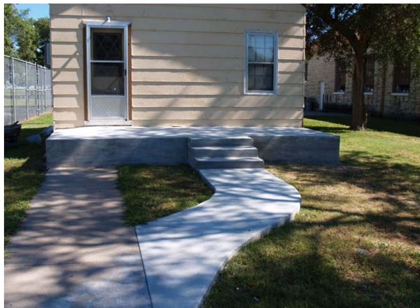
Priscilla Art Center Building