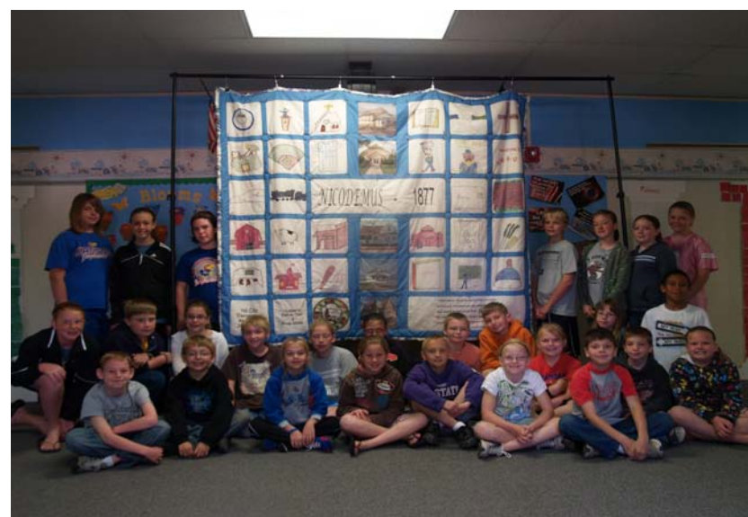
4th Grade Classes Hill City

Visit Fort Scott National Historic Site at http://www.nps.gov/fosc/planyourvisit/commonground.htm to view a slide show of students and quilters from four of the five parks assembling the quilts.