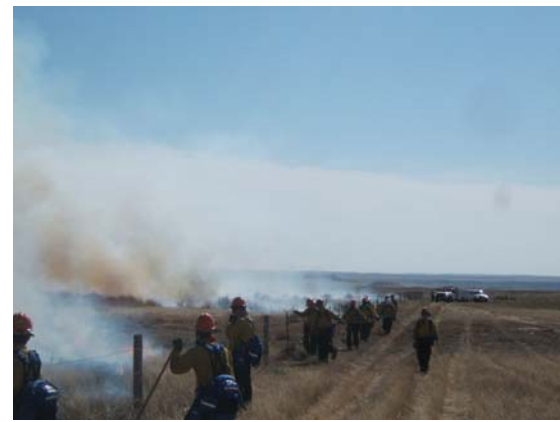
Holding along the west perimeter

The National Weather Service forecast predicted "Good" smoke dispersal with mixing heights 3500 to 4500 feet above ground level. With wind direction primarily north-northwest during ignition, smoke moved exclusively to the southeast. Initially, smoke did not rise significantly, but eventually rose to a height of greater than 1000' above ground level dispersing to the southeast. Smoke volume ranged from light to moderate. Moderate volumes occurred when ignition teams moved through favorable continuous fuel.