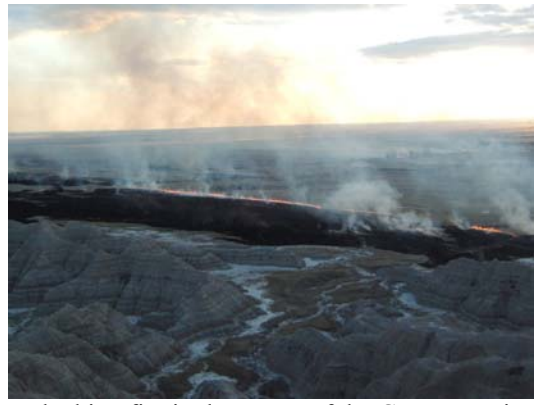
Flanking fire in the center of the Conata I unit with smoke dispersing to the southeast

The National Weather Service in Rapid City predicted a cold front passage with strong northwest winds for the day of October 11. Winds shifted from light southeast to northwest at 10-15 miles per hour at around 1030 a.m. These strong winds influenced fire behavior and ignition pattern through late afternoon.