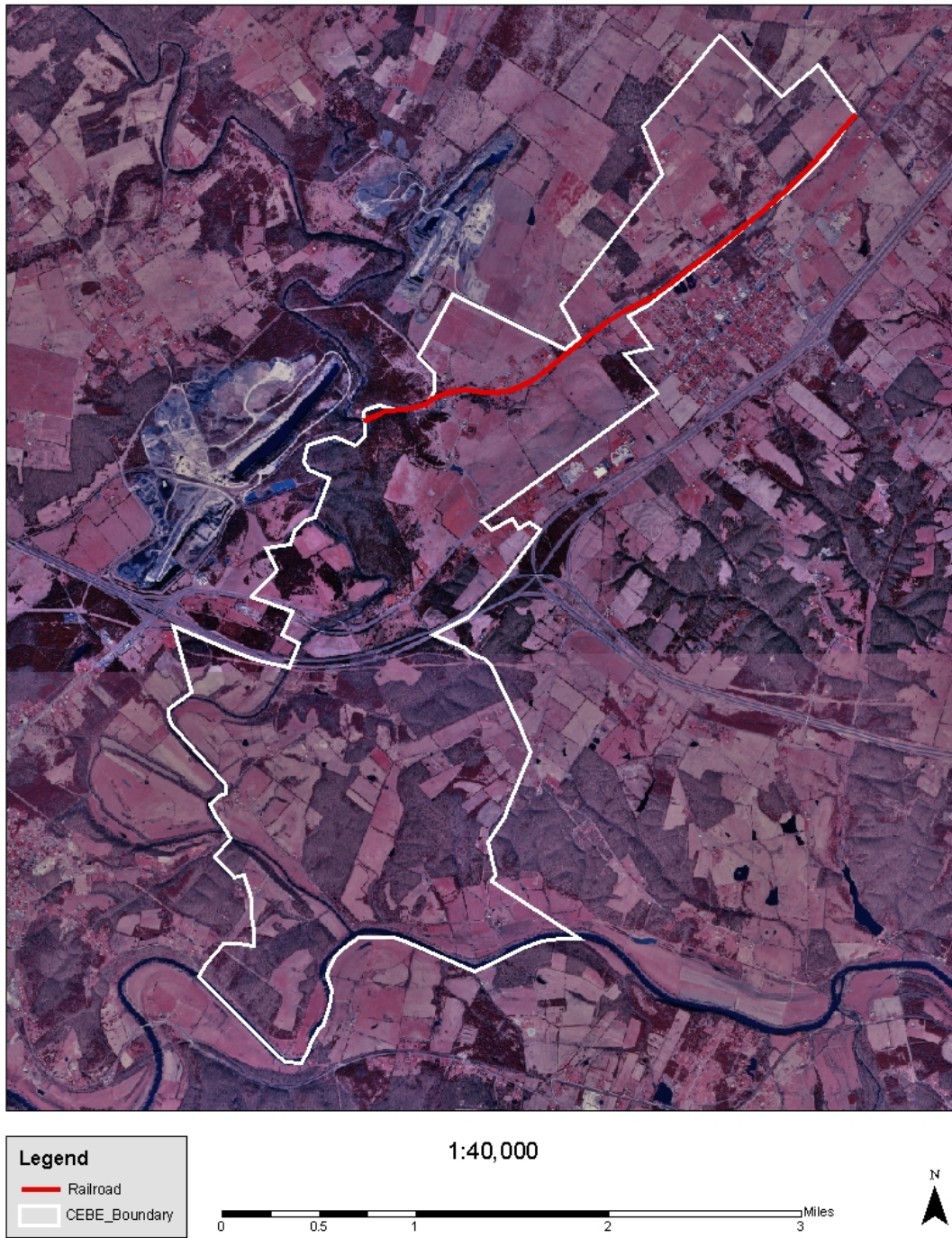
Figure 35. Railroad located within the Cedar Creek and Belle Grove National Historical Park (CEBE).