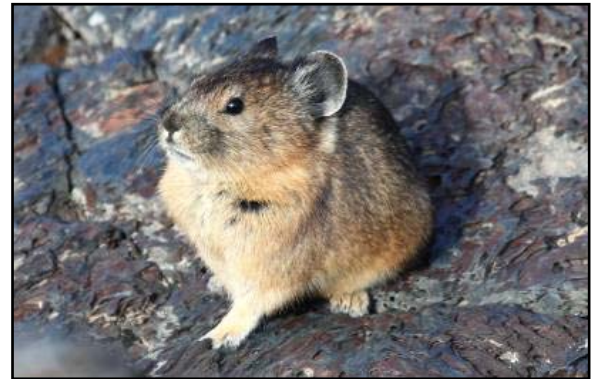
American Pika ( Ochotona princeps ) on lava flow at Craters of the Moon National Monument and Preserve (CRMO).