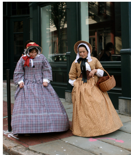
Stroll with the 1850s ladies!

Young visitors will create their very own log book, and then visit various stations within the visitor center to complete activities relating to whaling history.