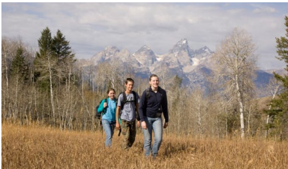
Young hikers in Teton country.

- 2010 Survey on youth and the outdoors Wyoming Youth Congress on Children and Nature