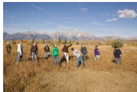
Youth enjoying the outdoors.

Work with project partners to determine the feasibility of trail creation and possible alignments. Provide assistance in locating funding and expertise in brochure and map development.