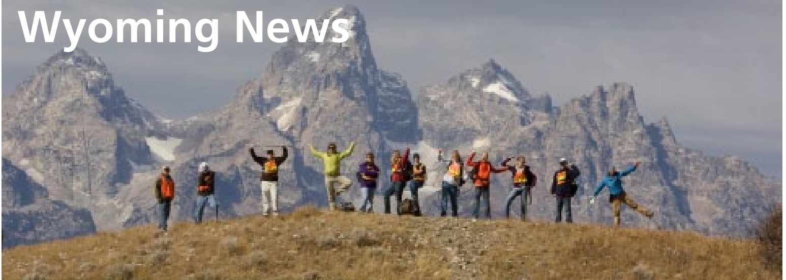
Wyoming youth at the Second Wyoming Youth Congress