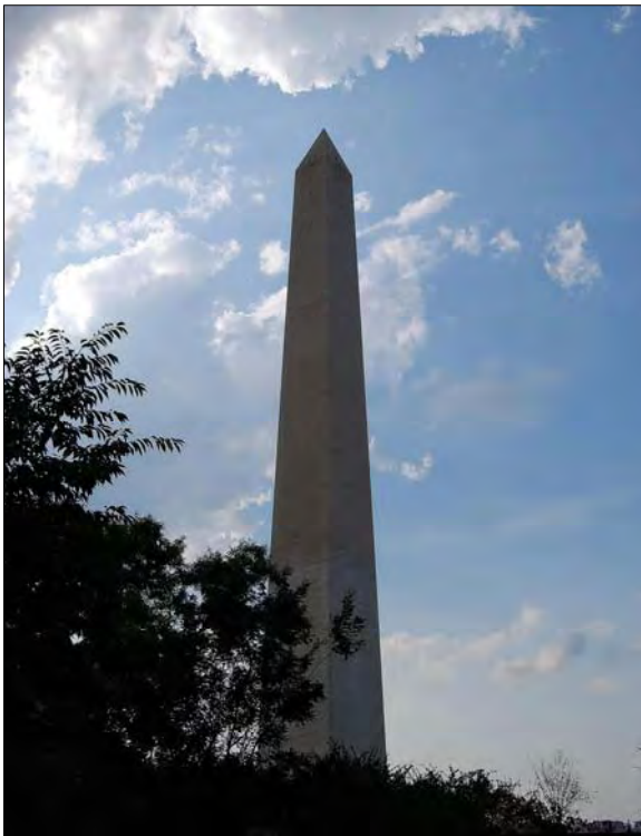
The Washington Monument from near the Sylvan Theater.