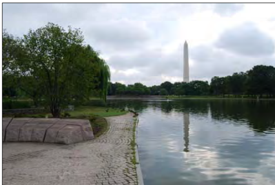
Looking from the island in Constitution Gardens Lake with the Memorial to the 56 Signers of the Declaration of Independence to the left.