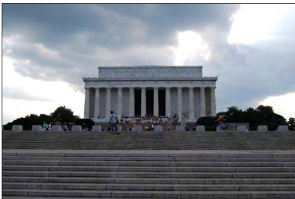
The Lincoln Memorial and steps.

The historic landscape design retains a great deal of integrity with existing plant materials, the elm walkways, and radial plantings around the base of the memorial and at the Watergate steps. The recommendations of the Lincoln Memorial Cultural Landscape Report , which seek to protect the historic design, would be implemented under all alternatives.