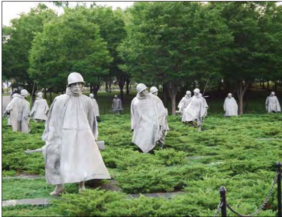
Looking west at the Korean War Veterans Memorial.

circulation improvements by others would be accommodated to simplify traffic patterns and to improve pedestrian connections from the Kennedy Center and adjacent neighborhoods.