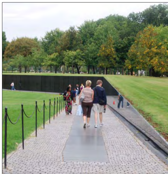
Looking west toward the Vietnam Veterans Memorial.