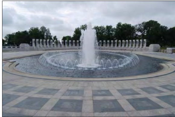
Looking south across the Rainbow Pool at the World War II Memorial.

drop-off and parking spaces. Ice-skating is allowed on natural ice when conditions are safe.