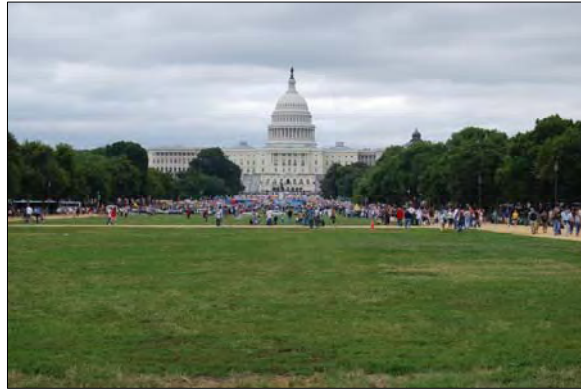
Looking east on the Mall to the United States Capitol.