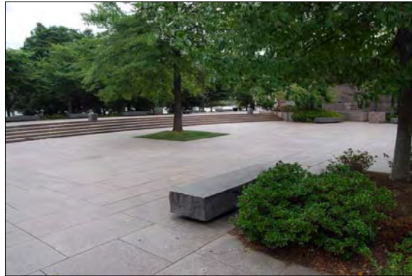
Room 4 at the Franklin Delano Roosevelt Memorial.