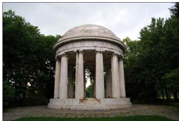
The D.C. War Memorial is within Ash Woods.