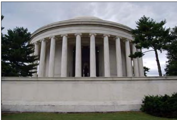
The south side of the Thomas Jefferson Memorial.