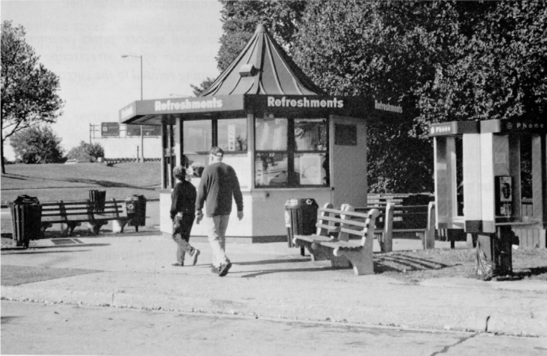
The refreshment kiosk southeast of the memorial is a non-contributing structure.