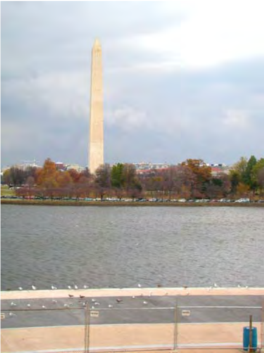
View to Washington Monument from Jefferson Memorial, 2000