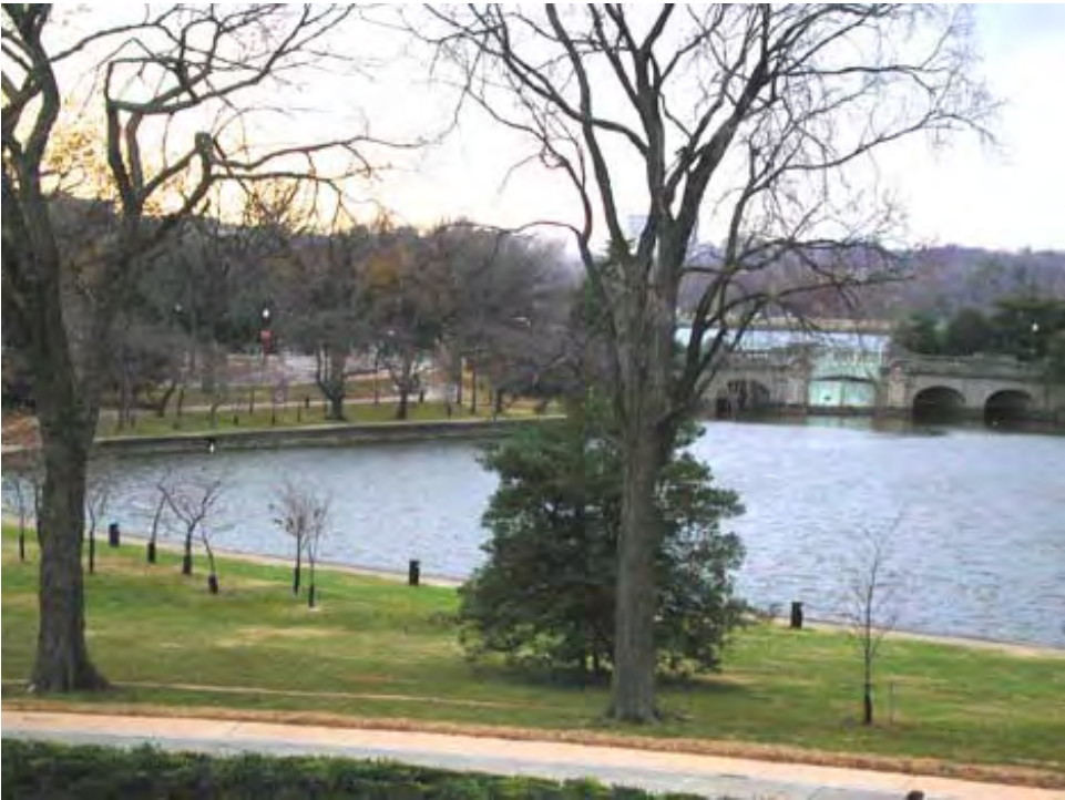
View west to Inlet and ring of cherry trees from Jefferson Memorial, 2000