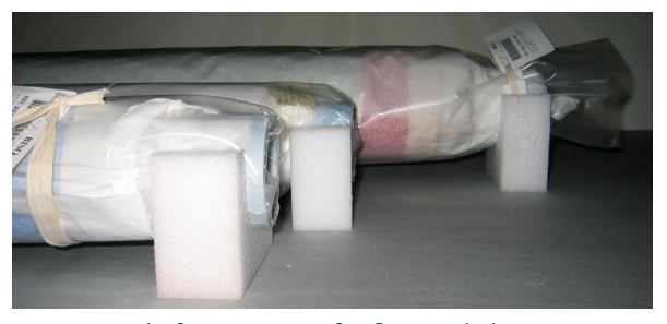
Figure 3. Ethafoam support for flag on shelving.

If flags are stored on open shelving or in a storage cabinet, use an ethafoam block or cradle to raise each end of the flag slightly above the shelf. This prevents the bottom of the rolled flag from being crushed by its own weight and that of the tube. The ethafoam block is about 2" thick, 3 - 4" high and 5 - 6" long. Trace the exterior curvature of the tube onto the ethafoam and cut along the line.