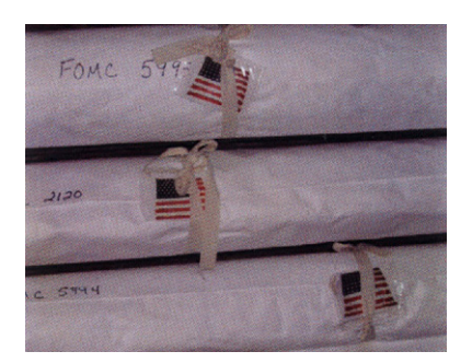
Figure 5. Wall storage with photo identification.