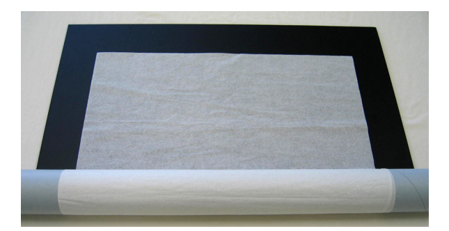
Figure 2. Tissue header on tube.

If the flag is stored on open shelving, cover the entire tube with an outer protective layer of soft wrap Tyvek®, prewashed cotton muslin, or polyethylene plastic. Tyvek® provides the best protective moisture barrier. Tie the rolled flag with 1 inch wide, undyed, cotton twill tape, using a bow or square knot. Place the ties 2 - 3 inches in from the ends of the tube, and evenly spaced across the length of the tube every 18 - 24 inches.