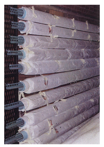
Figure 4. Flag storage on wall rack.

If wall space is available, make a stainless steel wall rack system to store the tubes. Metal poles or angle iron slip through the center of the storage tube and attach to brackets or hanging hooks on either end of the rack.