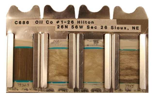
Figure 2. Geological thin sections made from a drill core.

Thin sections mounted on glass slides are usually stored separately from the boxes holding the core. Store slides in commercial microscope slide storage boxes.