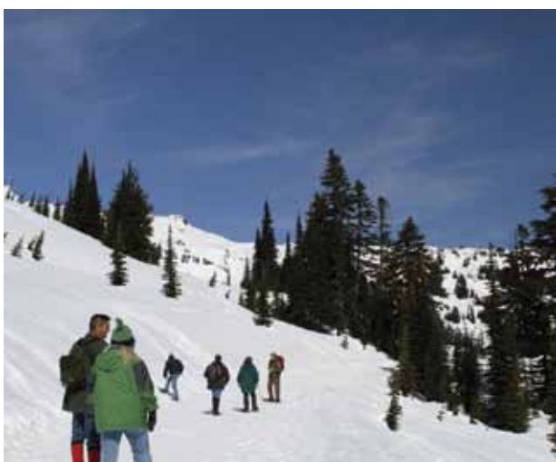
Snowshoe on your own or sign up to learn about the park's winter ecology on a snowshoe walk with a ranger.