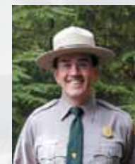
Superintendent Dave Ueberuaga

...to the winter wonderland of Mount Rainier National Park, one of the snowiest places on earth. Winter started early at Paradise with 59 inches of snow falling during our first winter storm in October, and a total of 220 inches of snow fell in the first two months of fall. On December 1, 2010 Paradise had 82 inches on the ground. Last winter we had a total snowfall of 650 inches at Paradise. In the winter of 1971-72, 1,122 inches, almost 100 feet of snow fell, which was a world record until 1999. Check at the visitor center to see how much snow we have on the day you visit the mountain.