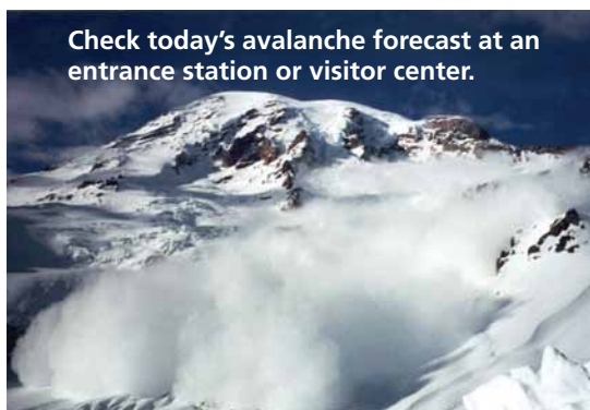
Check today's avalanche forecast at an entrance station or visitor center.