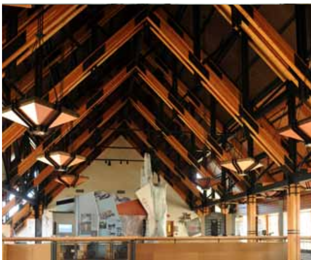
Visit the Henry M. Jackson Visitor Center at Paradise on weekends or holidays this winter and learn about the park through a new film and exhibits.

Be prepared for your own winter adaptations by wearing warm clothing with a waterproof outer layer, carrying tire chains in your car and reading the winter safety and recreation information on pages 2 and 3. For more information ask for a Winter Recreation brochure.