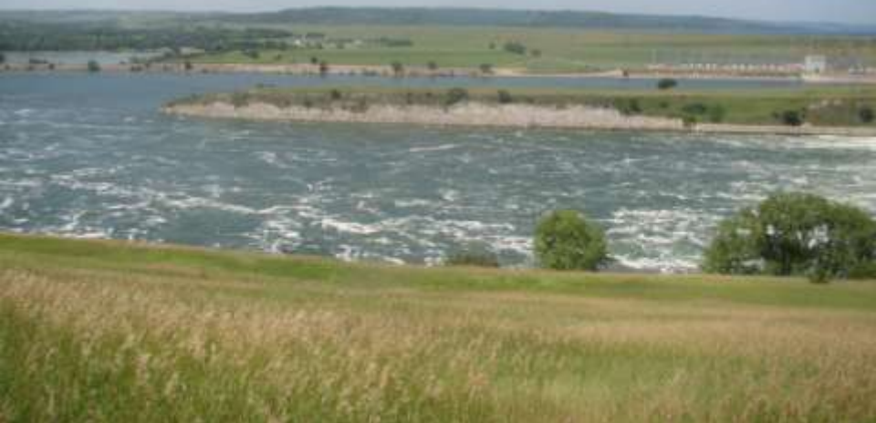
July 19, 2011 156,000 cfs Fort Randall Spillway