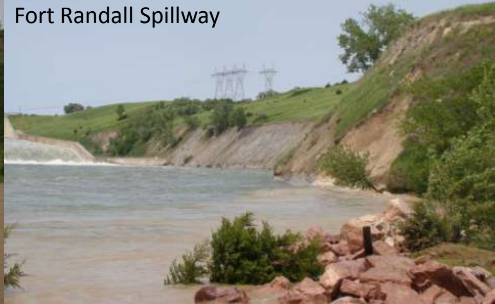
June 7, 2011 132,700 cfs Fort Randall Spillway