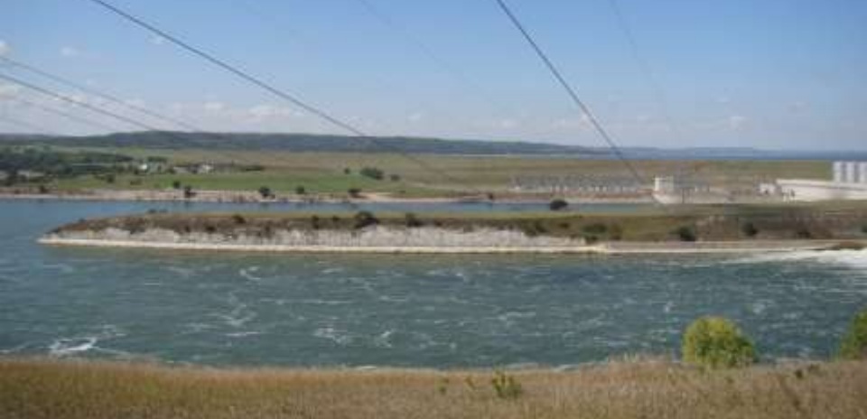
September 9, 2011 87,000 cfs Fort Randall Spillway