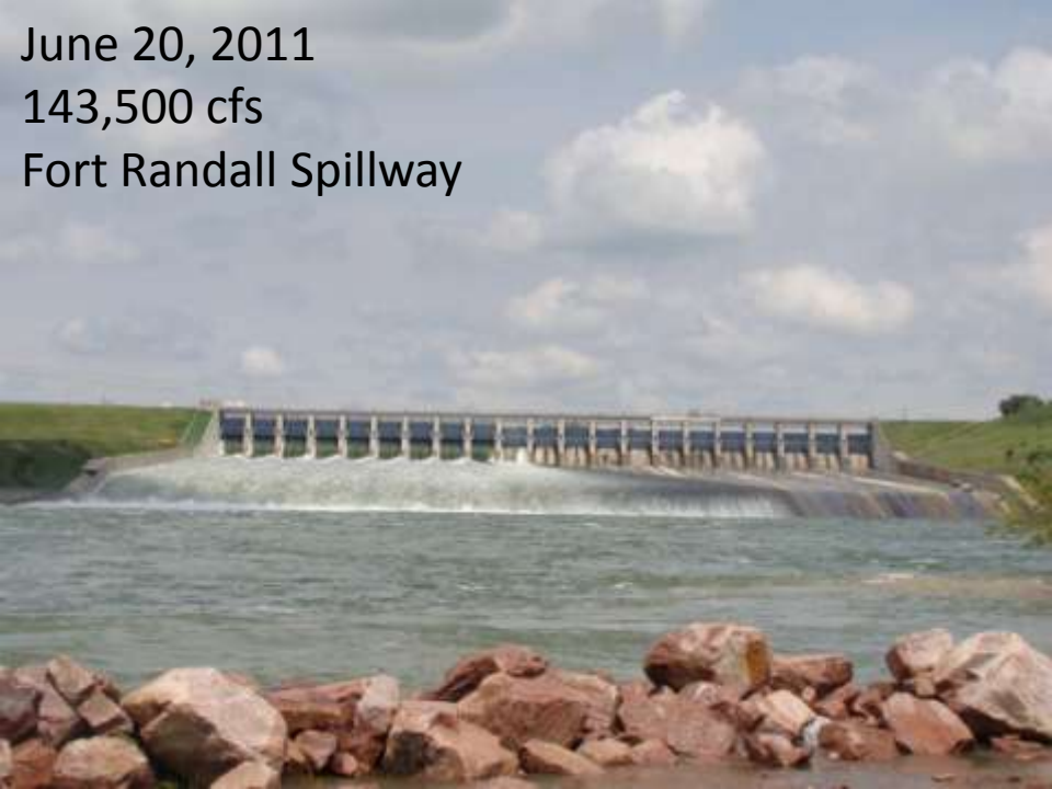
June 20, 2011 143,500 cfs Fort Randall Spillway