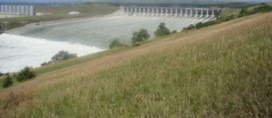
July 19, 2011 156,000 cfs Fort Randall Spillway