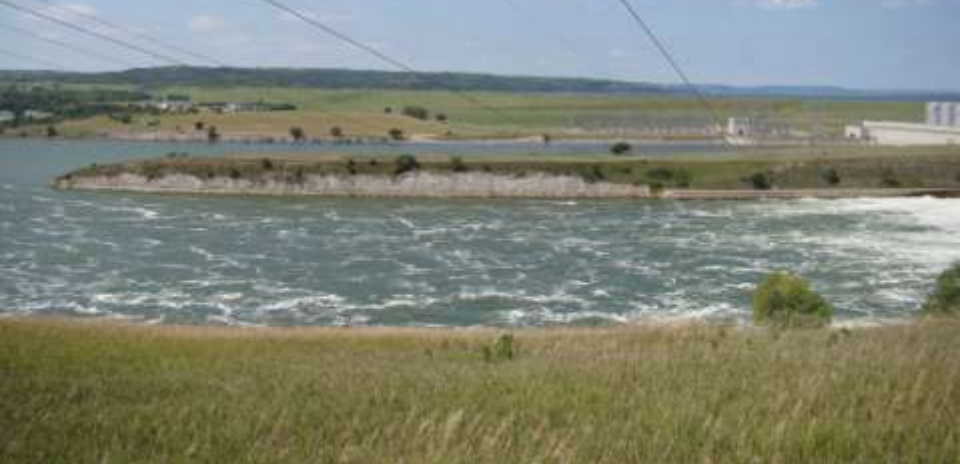
August 15, 2011 148,000 cfs Fort Randall Spillway