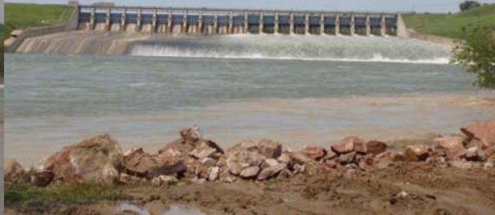
June 7, 2011 132,700 cfs Fort Randall Spillway