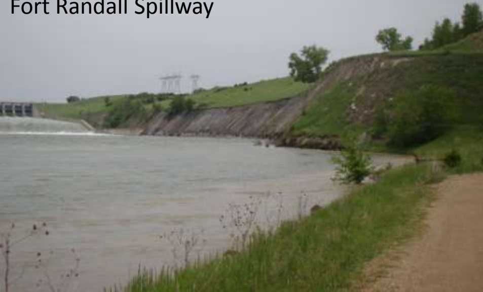
June 2, 2011 83,100 cfs Fort Randall Spillway