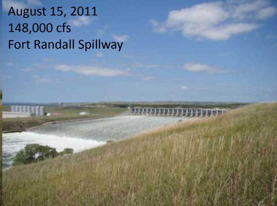
August 15, 2011 148,000 cfs Fort Randall Spillway