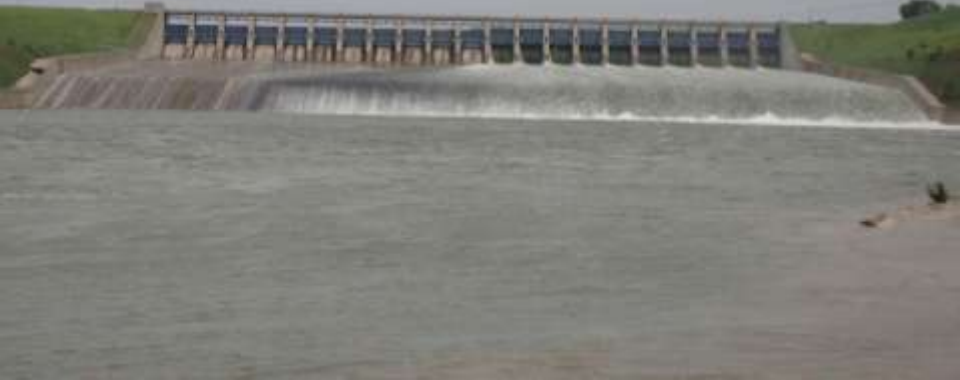
June 2, 2011 83,100 cfs Fort Randall Spillway