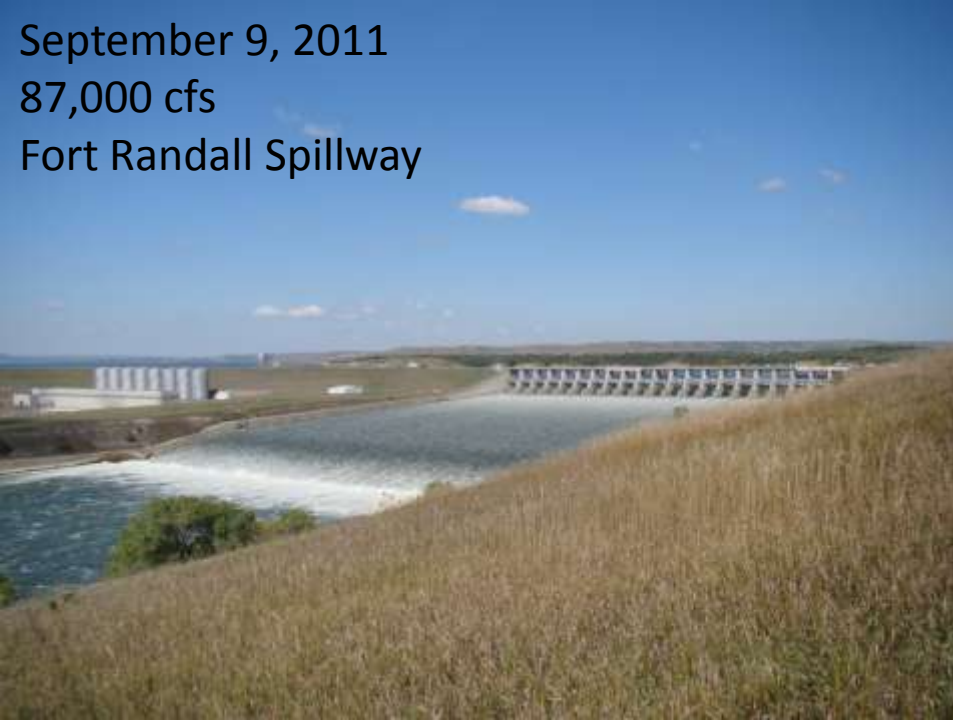
September 9, 2011 87,000 cfs Fort Randall Spillway