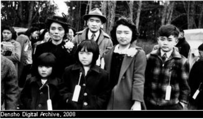
Densho Digital Archive, 2008

A Japanese American family wears numbered I.D. tags and waits to board a ferry that will take them from Bainbridge Island, Washington, to an incarceration camp at Manzanar, California, March 30, 1942. Densho Digital Archive, denshophd-i34-00080