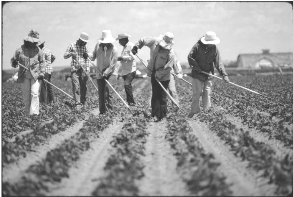
near Fort Collins, CO, 1972

National Archives, Records of the Environmental Protection Agency (412-DA-11420)