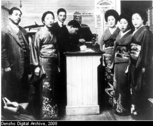
Picture brides being processed, c. 1910 Angel Island, California, Courtesy of California State Parks (Number 090-544). Densho ID: denshopd-i41-00003

This international crisis led to an agreement between the U.S. and Japan, signed in 1907 and 1908, and known as the Gentlemen’s Agreement. Under this agreement, laborers from Japan could no longer come to the mainland U.S. However, Japanese women were allowed to immigrate. Issei men traveled back to Japan to find wives, and many “picture brides” came to the United States. The Japanese immigrants put down roots, began families, and established communities up and down the West Coast. But discrimination continued, and Asian exclusion groups agitated for the Immigration Act of 1924, which stopped all immigration from Japan to the United States.