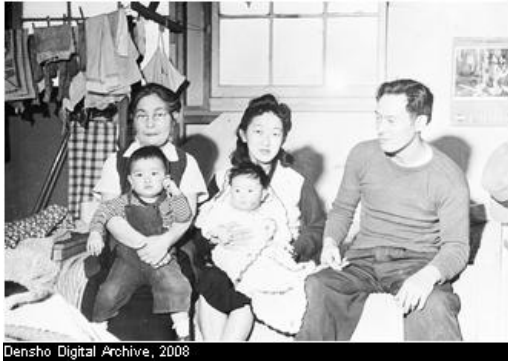
Japanese American family inside barrack, c. 1943, Minidoka incarceration camp, Idaho

land was another group that stayed on the -- came to escort us to Portland. And I remember that I was, when we approached there I was helping. I helped with name interpretation and pronunciation and with the, with the GIs that were helping us move. And so I was outside helping them with the names of people who were supposed to get on the train, and I heard a scuffle and pretty soon someone was being kicked off, one of the soldiers that were to accompany us was being thrown off the train. And it was very frightening to think, "Oh my goodness. What's going to happen to us?" And those who had been there said, "Don't worry. Nothing is going to happen to you. They had a little leave time in between and they got drunk. And so they were, but we told them that, gave them explicit instructions that nothing was going to happen to you."