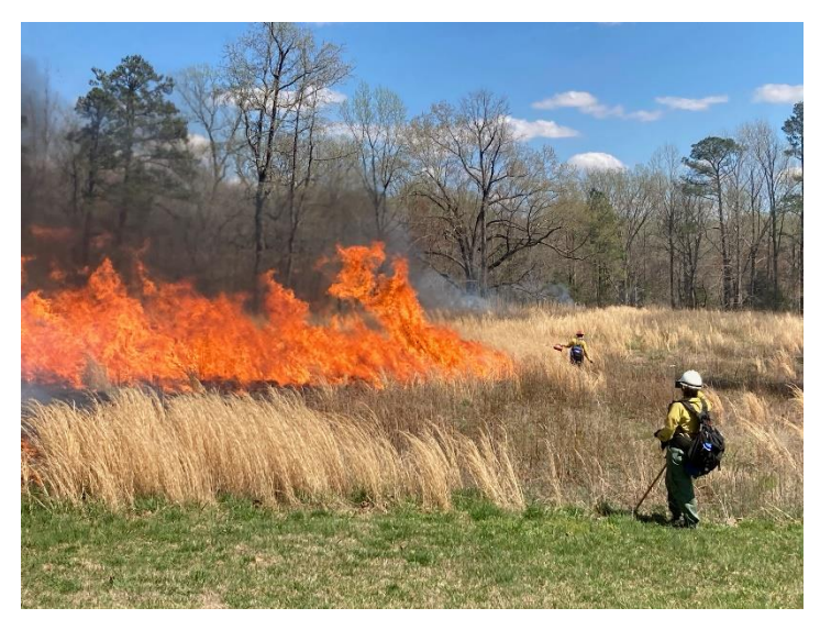
Above: Firefighters carefully observe the prescribed burn at Malvern Hill.