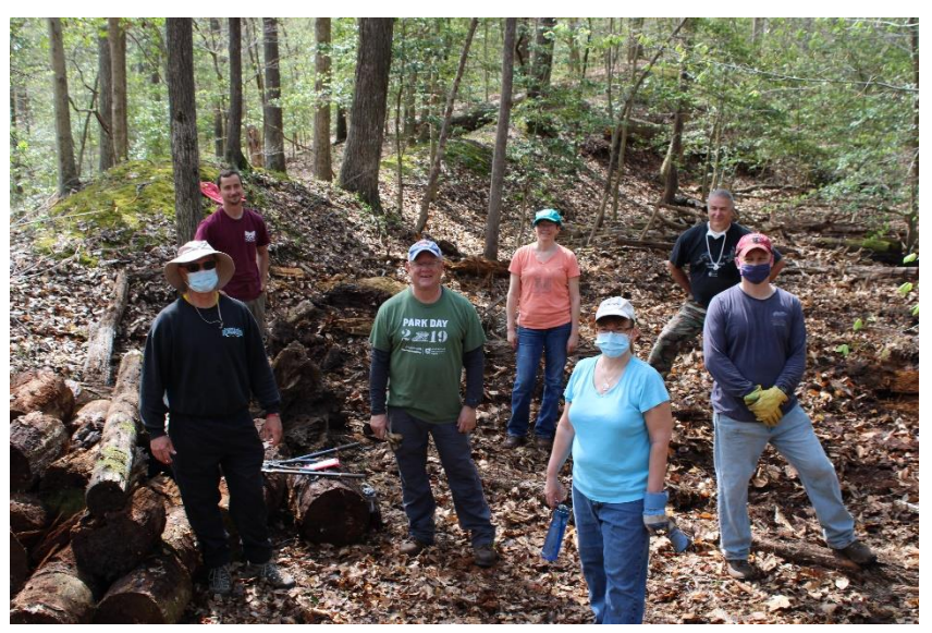
Above: Volunteers from the first Park Day shift pose in front of the newly cleared dumpsite at Gaines' Mill.

April 10 marked the American Battlefield Trust's 25<sup>th</sup> Park Day, an event where volunteers come together across the nation to preserve and maintain battlefield sites. 10 volunteers worked in two shifts at Gaines' Mill to clean up an abandoned dump site and remove agricultural fencing from the woods. With these projects complete, we're one step closer to restoring the historic landscape of this battlefield.