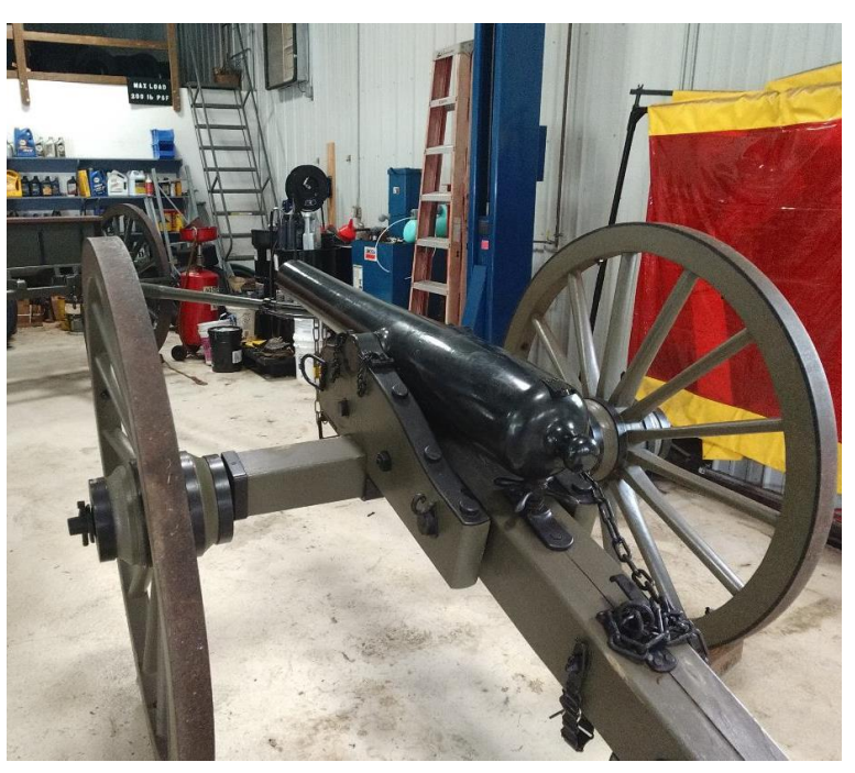
Above: The fully repaired cannon.