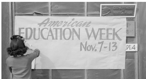
Education Week at Manzanar

Do you feel your experience in America today is different than it would have been in the 1940s? If so, how?