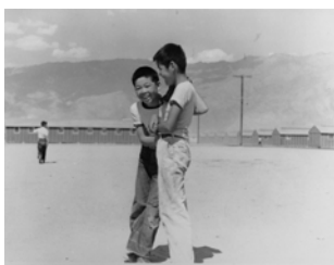
Dorethea Lange, 1942

CDE Standards: 10th Grade English/Language Arts Reading 3.2 History-Social Science 10.8.6 11th Grade English/Language Arts Reading 3.2 History-Social Science 11.7.5