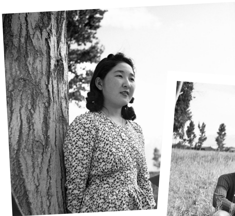
Manzanar, 1943

4. Rehearse your completed play and be prepared to present it to the class on _____.