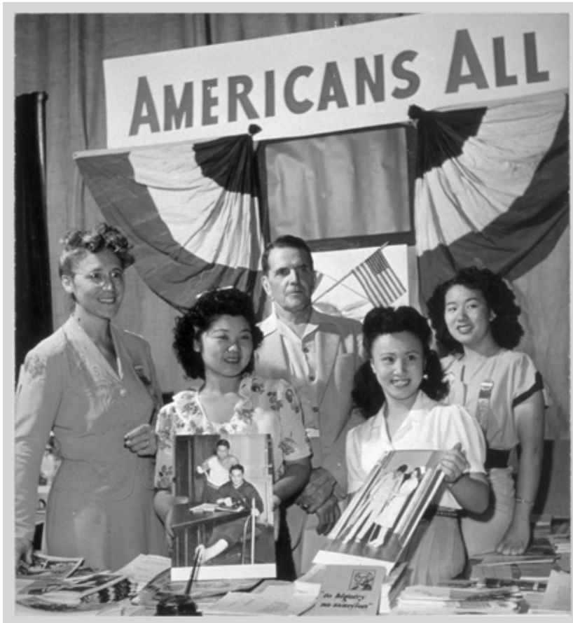
"Americans All" booth at the Pan-Pacific Industrial Exposition, Los Angeles, 1945

How do we start to understand different life experiences?