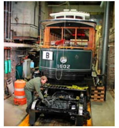
Left: Servicewide tree crew in Lowell. Tuning up the trolleys.