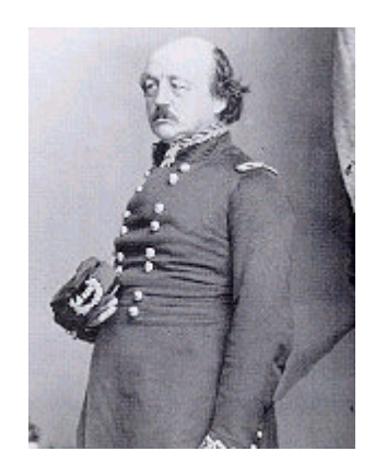
General Benjamin Butler

One of these figures was reportedly modeled after Benjamin F. Butler, a Civil War general, congressman, and later Governor of Massachusetts. The example in the Longfellow House-Washington's Headquarters NHS collection bears a strong resemblance to Butler. The toy still has its original box, with a notation on the label indicating a price of "3.50," roughly equivalent to $62.00 today. Also printed on the box is the name of the toy's designer, Arthur E. Hotchkiss, and the patent date, 1875.